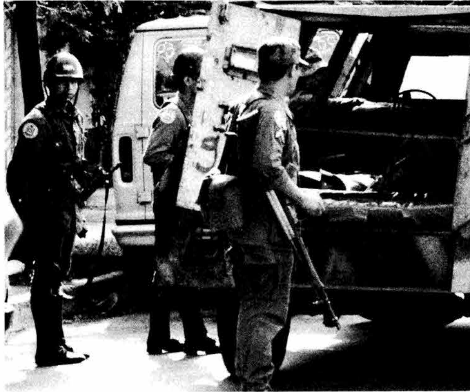
Salvadoran soldiers standing guard on street near union headquarters. Farabundo Martí National Liberation Front is demanding that army officers be prosecuted for human rights violations and that the army be purged and reorganized.