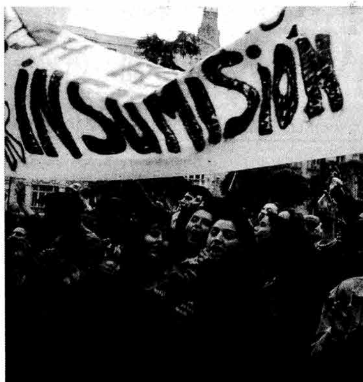
Young people in Spain protesting Mideast war

Last November the 8th International Commerce and Industry Fair in Havana, "the largest such fair in Latin America," took