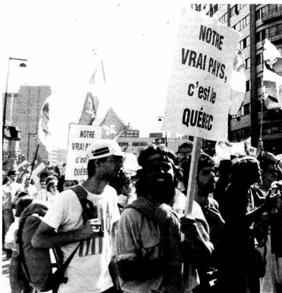
Montréal demonstration in 1990 for national rights. Signs read, "Our real country is Québec." Following a report released in January by the Québec Liberal Party calling for "full sovereignty," Canada's prime minister declared that "Canada is not up for grabs."

Québécois suffer systematic discrimination on the basis of their language. In