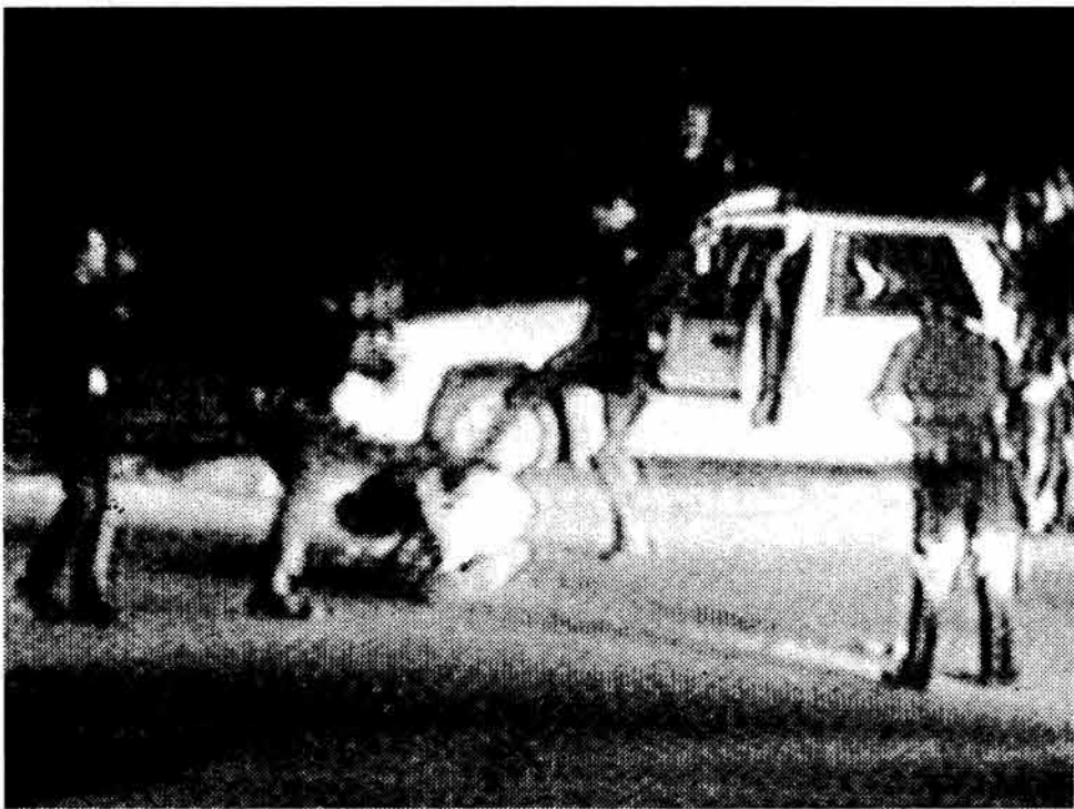
Photo taken from video of Los Angeles police beating Rodney King on March 3