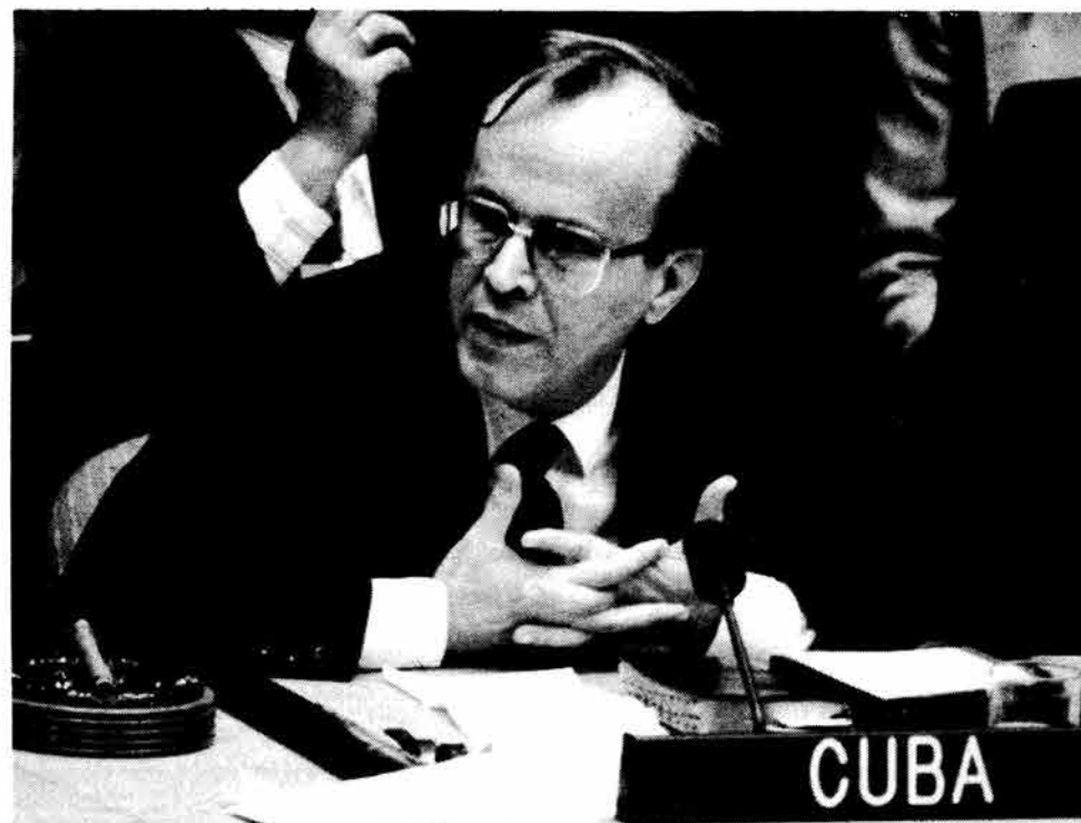
Cuban representative Ricardo Alarcón at the United Nations. "We are convened to be offered another example of the desire on the part of some to use this organization for their own interests," he explained.

TAKING NOTE of the letters of the Foreign Minister of Iraq confirming Iraq's agreement to comply fully with all of the resolutions noted above (S/22275), and stating its intention to release prisoners of war immediately (S/22273),