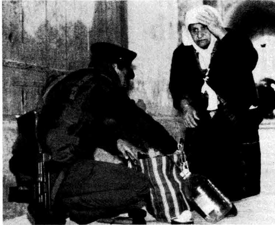
Israeli cop conducting a search of a Palestinian woman's bag

Al Fajr reported that "Israeli authorities were only allowing laborers whose Israeli bosses had come in person to the 'civil administration' to apply for work permits."