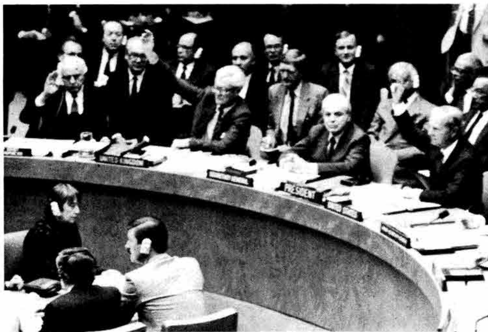
Meeting of UN Security Council on November 29, 1990, authorized war against Iraq.