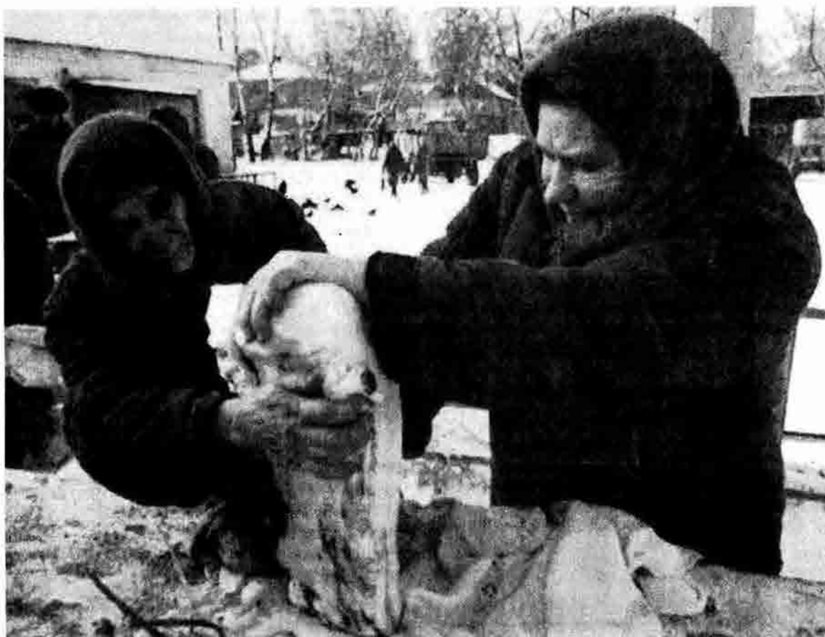
Russian villagers prepare pork to sell. In recent months, basic food prices have skyrocketed.

Some 45,000 small enterprises have been privatized in Russia, but basic industry remains under state control with 80 percent of the gross national product coming from the state sector. According to the Journal , the Russian government has set a goal of privatizing 500 large companies a month.