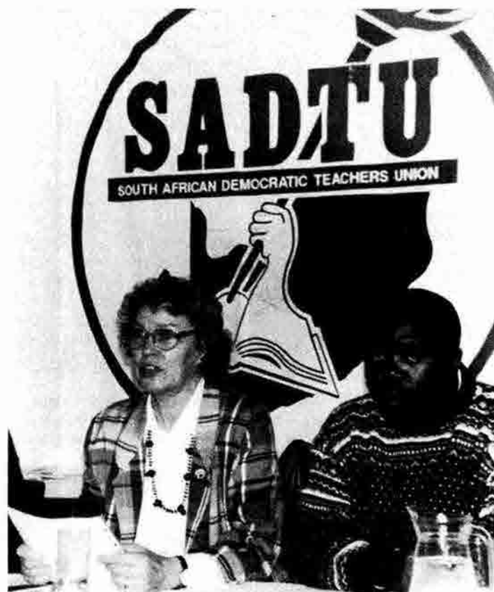
Visiting teachers' union leader from Norway (left) with leader of South African Democratic Teachers Union at March 2 SADTU press conference in Johannesburg.

The ANC demanded that "decisions around the crisis be made after thorough