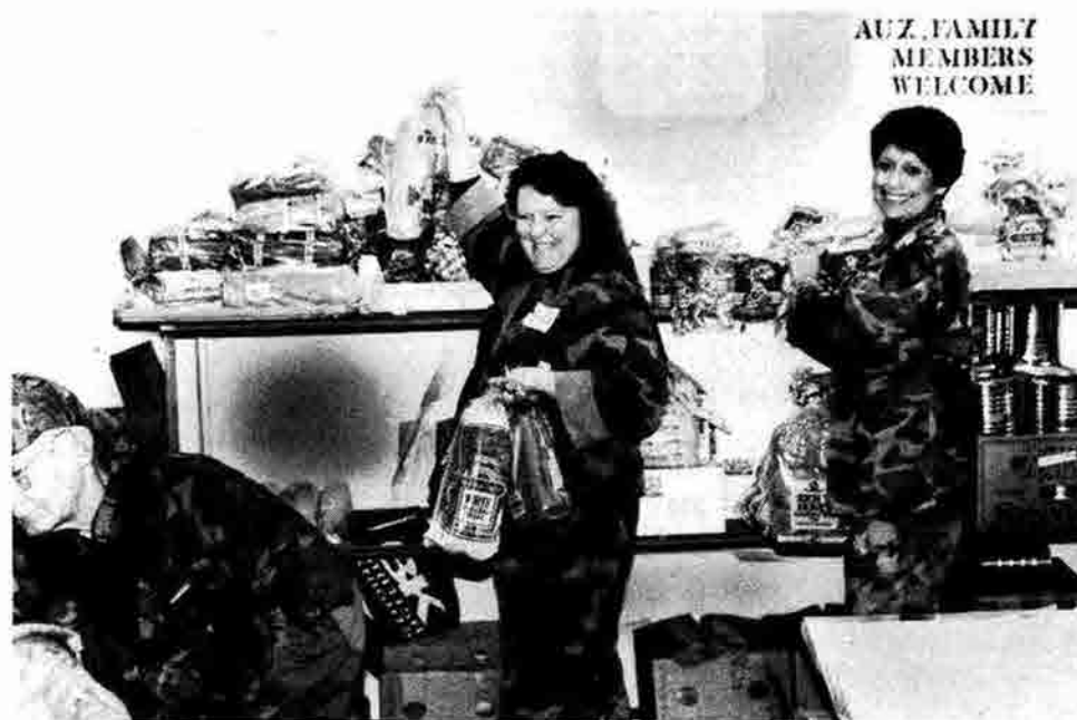
Miners and supporters at strike kitchen in Shawneetown, Illinois. The strike center was closed after victory, but miners are prepared to reopen it on short notice.

But Noss reports the local union is ready to resume the strike. The well-organized strike center and kitchen, run by union local members and the family auxiliary, were carefully packed up and closed down, but the miners are ready to reopen them on very short notice.