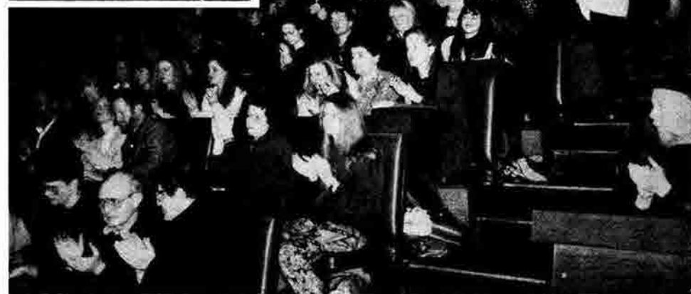
Some 1,300 people came to meetings in Britain, like this one at the University of Wales in Cardiff, to hear Cuban economist Carlos Tablada (inset).

the former Soviet Union and Eastern European countries; in 1989 it was 85 percent.