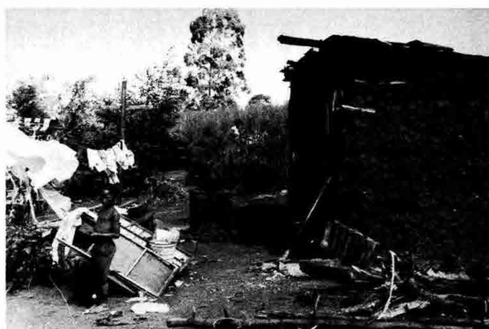
Rural area in Pietermaritzburg, Natal. Some 2,700 have died in fighting in that region since 1991. "You have a duty to go to members of Inkatha and tell them there is no reason we should slaughter one another," Mandela told a rally of supporters.

In all of his talks in Natal, Mandela cautioned supporters against any complacency