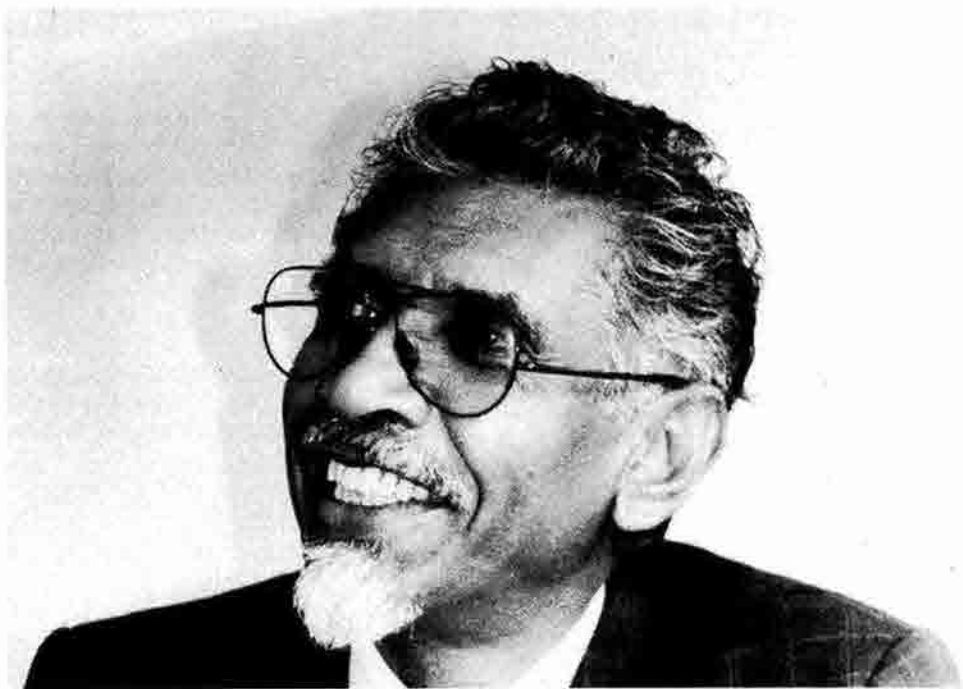
Mac Maharaj, member of ANC National Executive Committee and negotiating team.

Each attempt by the ruling National Party to create obstacles to the talks since the unbanning of the ANC in 1990 has been met by resistance by millions of workers and youth. "As a result of the mass actions," Maharaj said, "the regime has lost all initia-