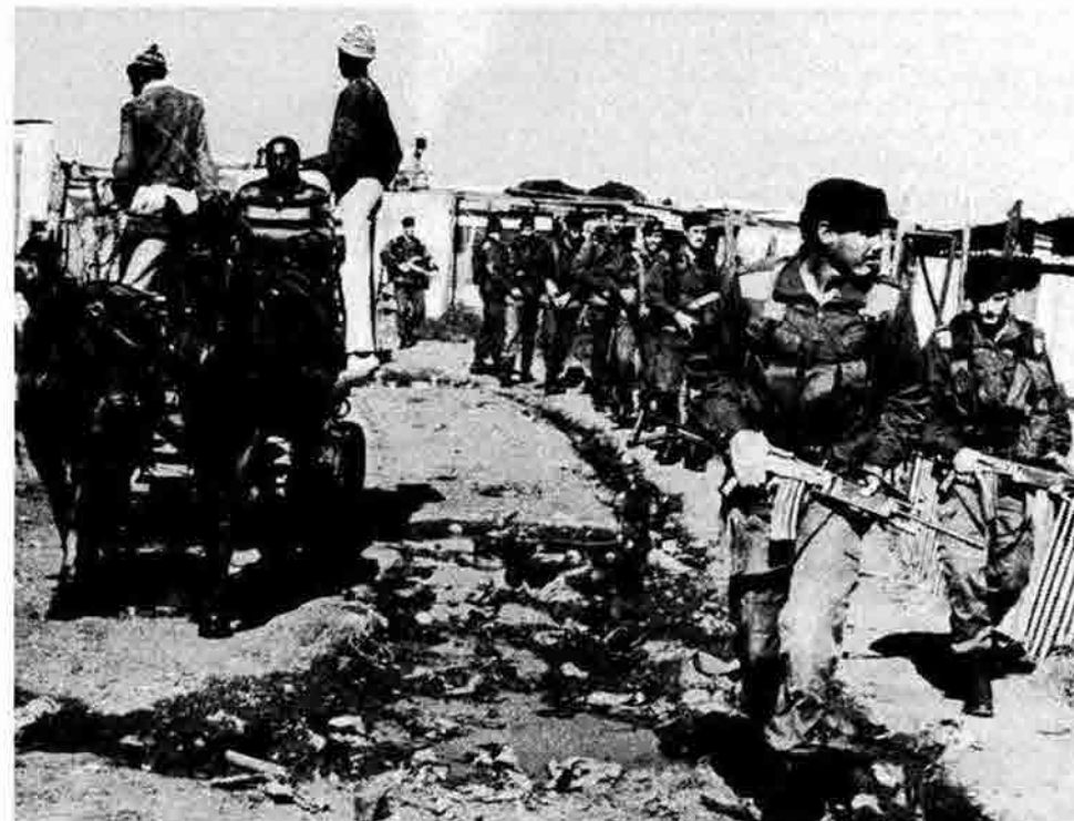
South African troops patrol Soweto, near Johannesburg, in 1992. Government security forces have played major role in fostering and carrying out violent attacks.

The Bantustan governments in KwaZulu, Ciskei, and Bophuthatswana have backed the ruling National Party, and even parties to its right, in opposing the ANC's fight for a unitary nonracial, democratic South Africa. The governments of several others — Transkei, KwaNdebele, KaNgwane, Gazankulu, and Lebowa — have aligned themselves more or less with the ANC.