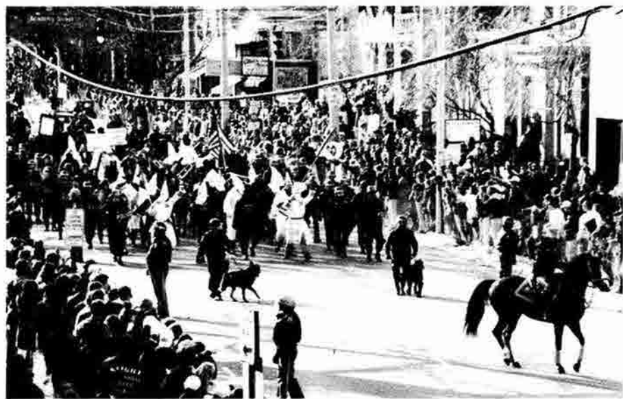
About 100 members of the Ku Klux Klan and other ultrarightists marched February 27 in Newark, Delaware, for seven minutes. Of the 2,500 spectators, a few cheered the Klan. The majority of the youthful crowd greeted them with obscenities and snowballs. One thousand people took part in a counterdemonstration a few blocks away.

The United States government and officials of the European Community (EC) exchanged threats of trade sanctions after U.S. trade representative Mickey Kantor pulled out of trade talks March 12. Each side wants the other to allow foreign competitors to win more public contracts in areas such as telecommunications, electricity, and water supplies. Washington is threatening to cut companies based in Western European countries out of sections of the U.S. market; the EC is considering retaliatory trade measures.