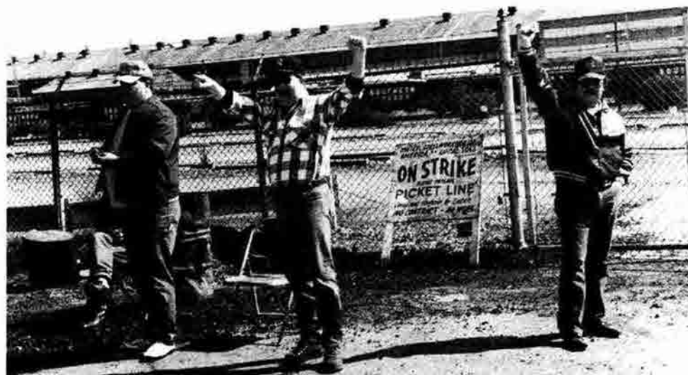
Trinity Industries strikers on picket line in Bessemer, Alabama.