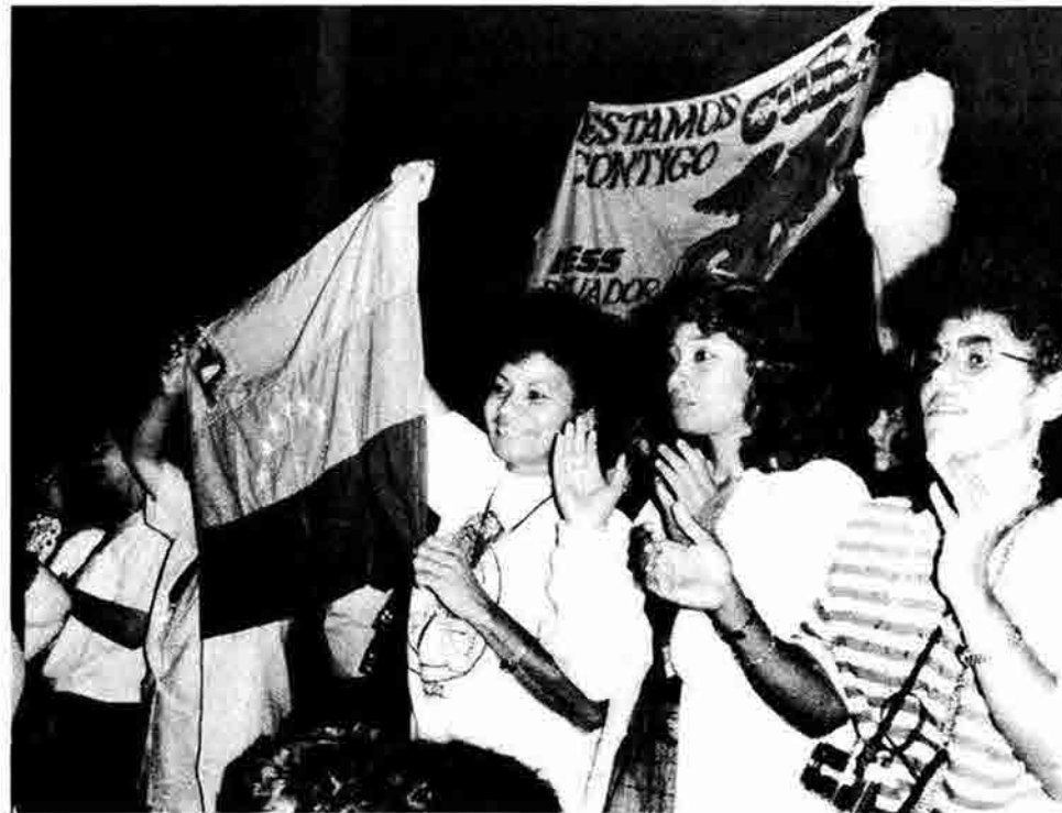
Delegates at conference hosted by Federation of Cuban Women in Havana. More than 400 women from around the world participated in the gathering.

Discussions at the conference, both formal and informal, revolved around the impact of the deep economic crisis in Cuba. Beginning in 1989 with the rapid disintegration of the Stalinist regimes in Eastern Europe and the Soviet Union, Cuba's vital supply line of oil, food, raw materials, and spare parts disappeared virtually overnight. Under pressure from the draconian U.S. trade embargo that has been in effect for 33