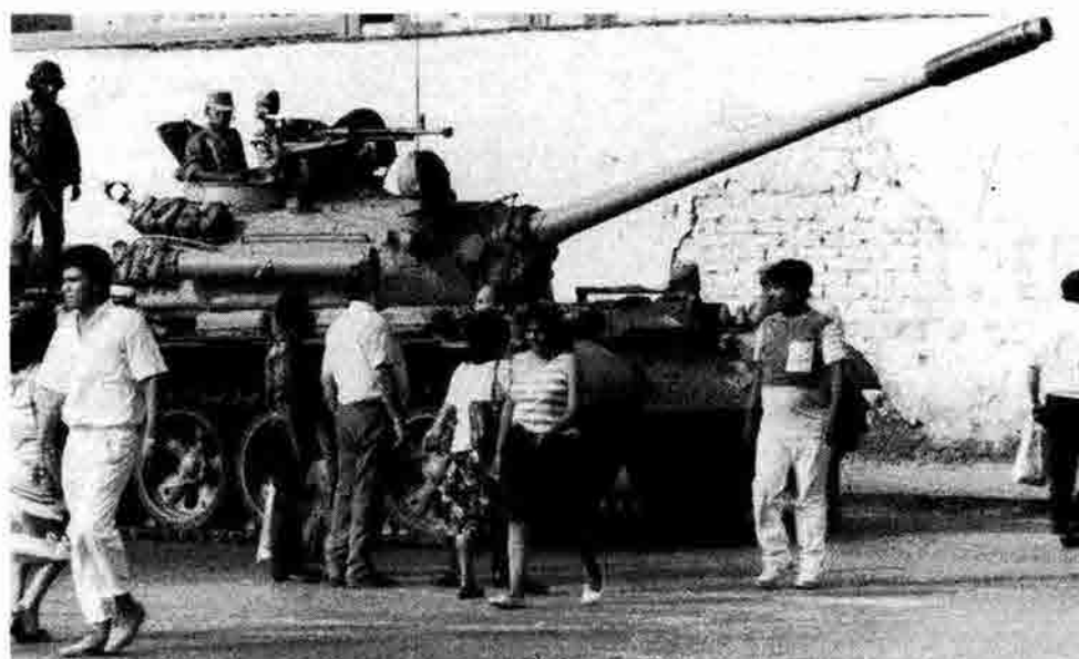
Tanks patrol streets of Lima. In the name of combating terrorism, Peruvian regime has unleashed savage repression against the country's workers and farmers.

Fujimori, however, has no moral or political right to pass judgment on Guzmán's outfit. The regime's war on democratic rights, including the illegitimate trial and sentencing of Guzmán, should be opposed.