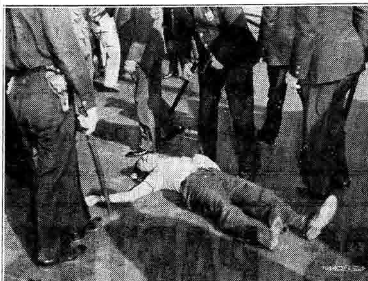
Preparing the war for democracy—New York cops ruthlessly clubbed pickets outside the Air King Radio Corporation plant in Brooklyn, N. Y., last week. The striker stretched out above was one of 13 injured in the attack by hundreds of policemen.