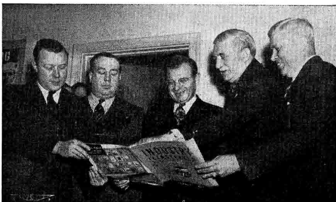
Shown as they discussed the auto industry situation at the OPM conference in Washington are Walter Reuther and R. J. Thomas, officers of the United Automobile Workers, CIO, William Knudsen and Sidney Hillman of the OPM, and C. E. Wilson, president of General Motors.