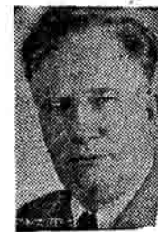
J. P. CANNON

HEAR JAMES P. CANNON National Secretary, SWP