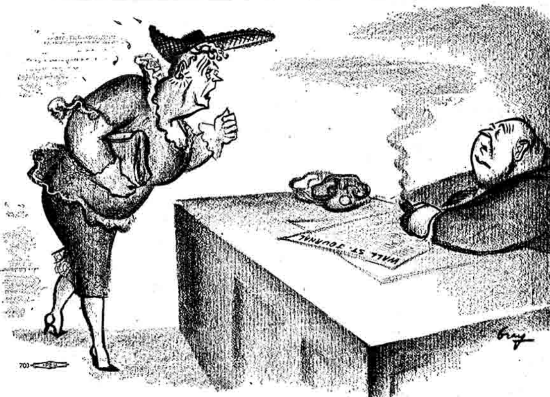
"The cook threatened to strike — can't we have her arrested under your Smith-whatcha-ma-callit law?"

The Los Angeles CIO has started the defense of American labor against native fascism. Now it must be followed up throughout the entire country!