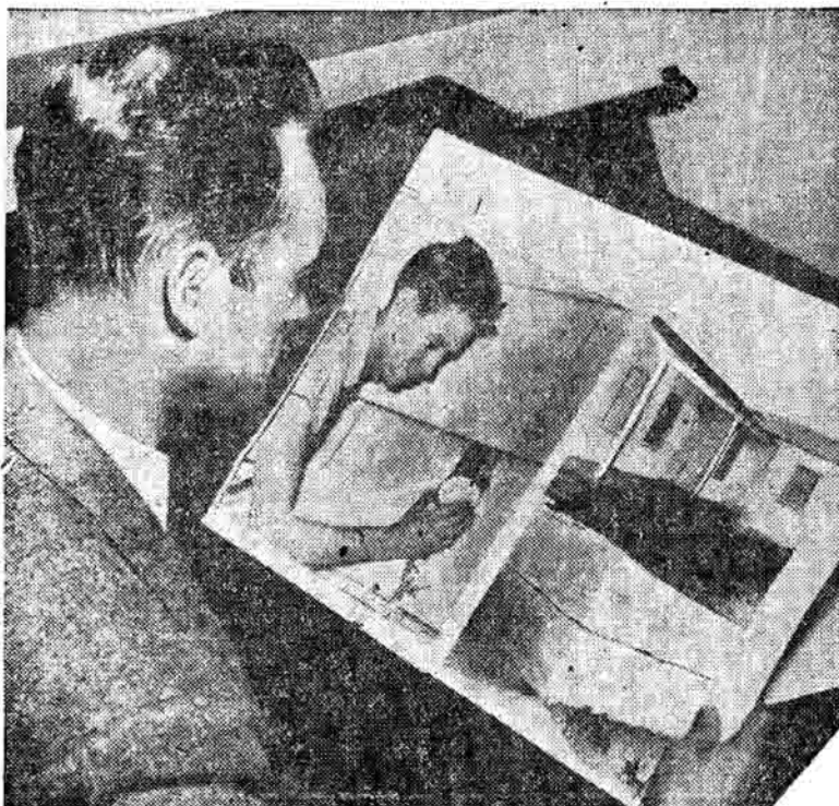
Veterans who bought houses at exorbitant prices didn't get very much, as this photo-exhibit to be presented to the joint congressional housing commission shows. On the left is a hole made in a wall by an 8-year-old boy who tossed a baseball. The other shows a porch breaking away and a foundation falling apart.