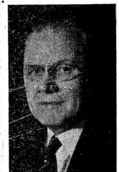
Senator Burton K. Wheeler, and even announced his acceptance.

They had reached a point of frustration and desperation when they were actually considering appointing one of their own number to keep the job from going begging. At the last moment, however, they dug up a likely candidate, ex-