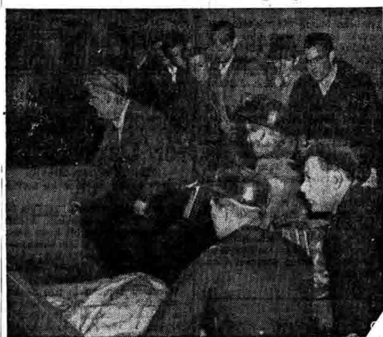
Gathered about the blanket-shrouded body of one of the workers killed in a mine explosion at Greenwood, Ark., grim-faced relatives and friends seek to identify the victim. The blast ripped through the gas-filled main shaft of the Sunshine coal mine, killing eight miners.