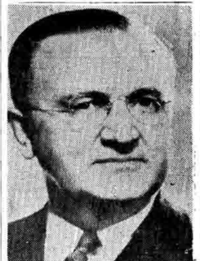
Thomas B. McCabe, reactionary Republican Philadelphia banker and president of the Scott Paper Co. (Scott Tissue), who was appointed by Truman as chairman of the Federal Reserve Board. He replaces Eccles, the Roosevelt New Deal financier from Utah.