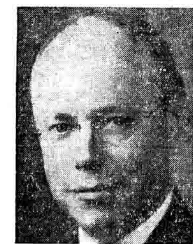
ROBERT A. TAFT

All pretense that the ERP is just an "economic recovery" program has been abandoned. As Chairman Charles A. Eaton of the House Foreign Affairs Committee admitted on March 22, a third world war is "not very remote" and "all this aid is essentially military aid."