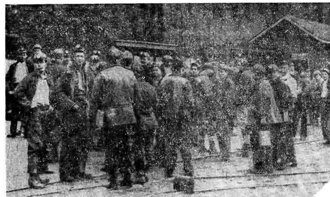
These Pittsburgh members of the United Mine Workers join the walkout of soft coal miners to protest the coal operators' failure to set up a pension plan. On March 12, UMW President John L. Lewis announced the mine owners had "dishonored" their contract; on March 15, miners struck.