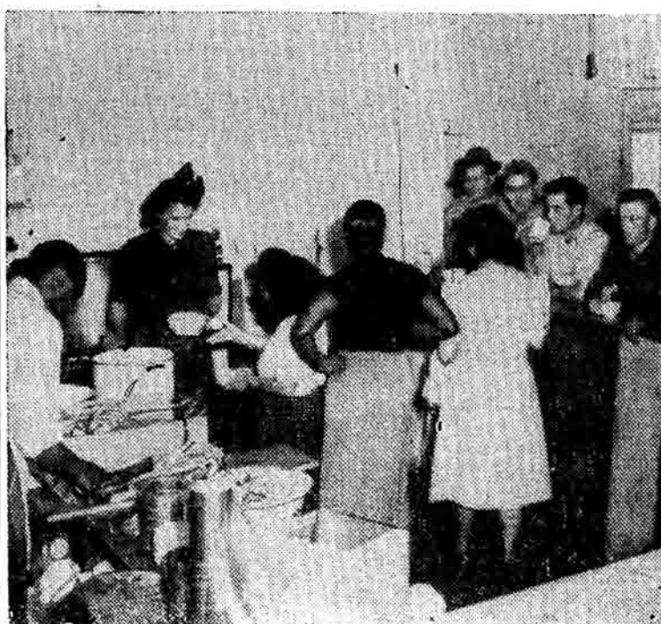
Strikers of CIO United Packinghouse Workers are lining up for soup in their rebuilt headquarters recently wrecked by a brutal attack of Kansas City cops.