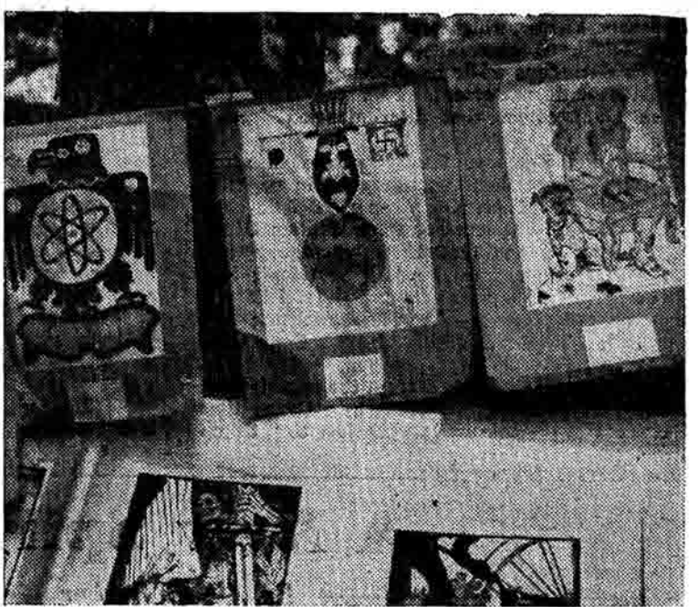
Chinese students at St. John's University in Shanghai have opened an exhibition of anti-American woodcuts and cartoons in protest against Washington's program. These three drawings show Uncle Sam decorated with swastikas and the Japanese emblem, the rising sun.