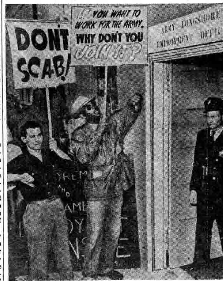
When the U. S. army tried to recruit scabs in San Francisco against the West coast longshoremen strike, the union put a picket line around the fink hall and put a stop to the scabbing.