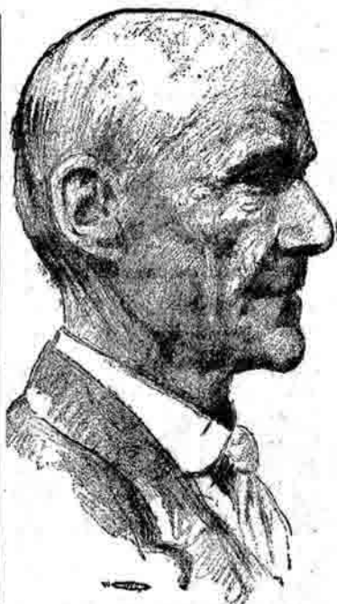
EUGENE V. DEBS

Debs referred, of course, to the Bolshevik party of Lenin and Trotsky. Had he lived to see Stalin betray the world working class, we are confident that Debs, the international socialist, would have supported the Trotskyist movement in our 25-year struggle