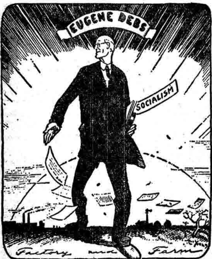
“The Sower,” by Art Young

Tune In! Farrell Dobbs speaks on “THE STRUGGLE FOR CIVIL RIGHTS” Saturday, Oct. 2 - 9:30 P. M. WMGM - 1050 on your dial