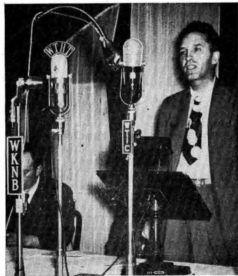
Farrell Dobbs, Socialist Workers candidate for President, speaking over a hookup of 15 Connecticut stations, including an ABC and Yankee Network, independent and NBC radio stations, from the Connecticut SWP state convention at Hartford on Oct. 3.