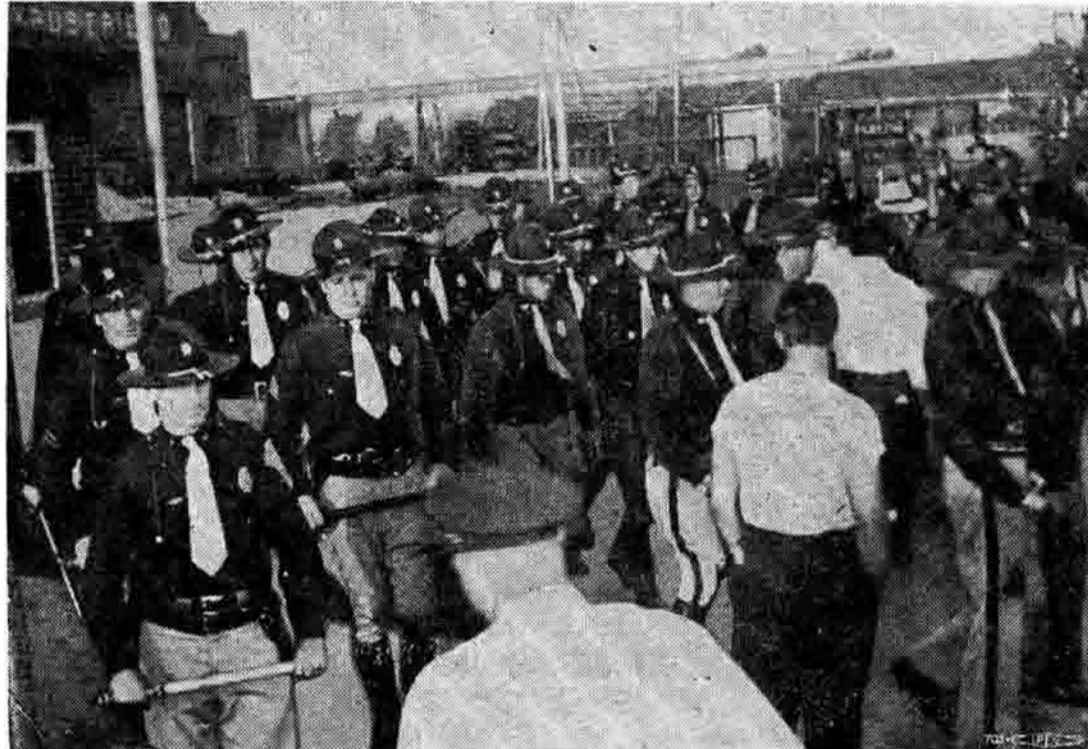
This solid wall of armed Indiana state troopers broke the strike of CIO United Electrical members at the Bucyrus-Erie plant in Evansville. Congressmen from the Hartley Committee moved in then and helped smash up the local union.