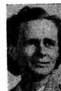
Candidate for U. S. Vice-President