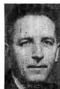
Candidate for U. S. President

Another policy is being expressed more and more on the picket lines. It is advanced by men who work in the industry and feel in their daily lives what is at stake in this strike. This policy calls for a "tight strike." It means to tie up everything possible. Such a policy would result in the eventual paralysis of large sections of industry on the Pacific Coast. It would bring great pressure on the ship operators to settle with the striking unions. Such a policy would win the strike.