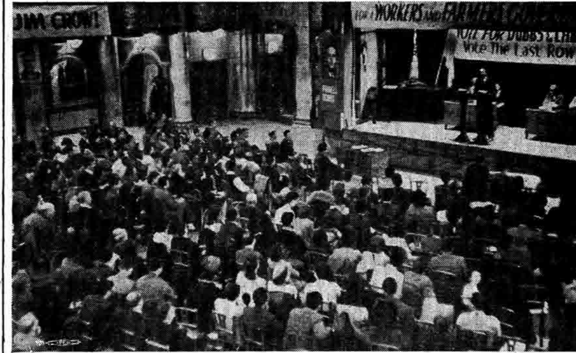
The final election rally in New York City held at the Hotel Diplomat. Farrell Dobbs, SWP Presidential candidate is addressing the audience.