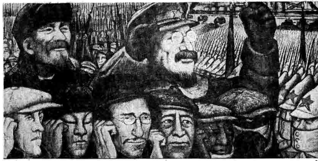
A reproduction of a mural of the Russian Revolution by Diego Rivera; Lenin and Trotsky are shown reviewing the troops of the Red Army. The original mural is in the library of the New York SWP headquarters, 116 University Place.

Thus they convert Trotsky, Lenin and Marx into amoral devils and the science of Marxism into a "religion" that has no connection with reality.