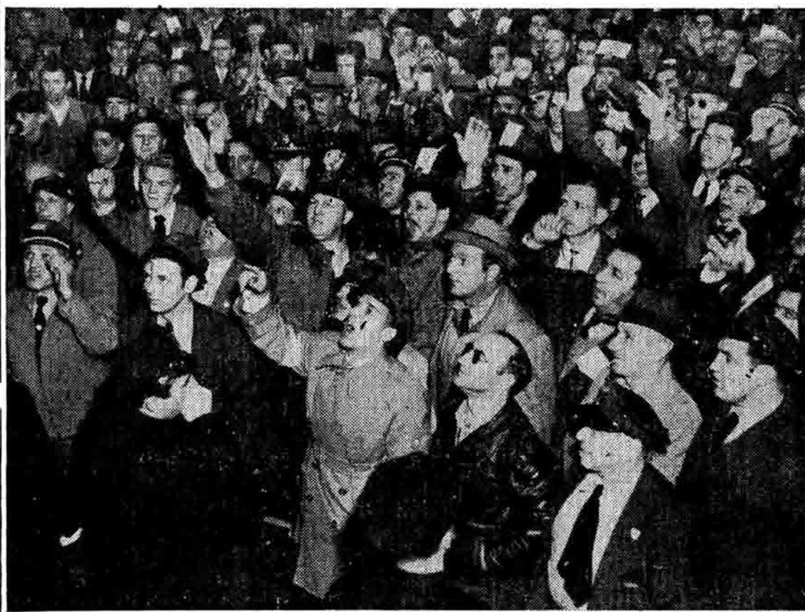
N. Y. bus drivers, members of the CIO Transport Union, howl down their International President, Michael Quill as he orders them back to work. The union called the men out on strike to win long-overdue retroactive pay. But after five hours, Quill called the strike off and informed the membership that only a "demonstration" had been intended. It was 24 hours before the bus drivers finally all returned to work.