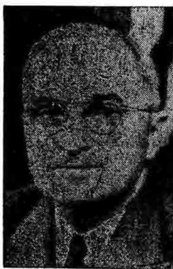
HARRY S. TRUMAN