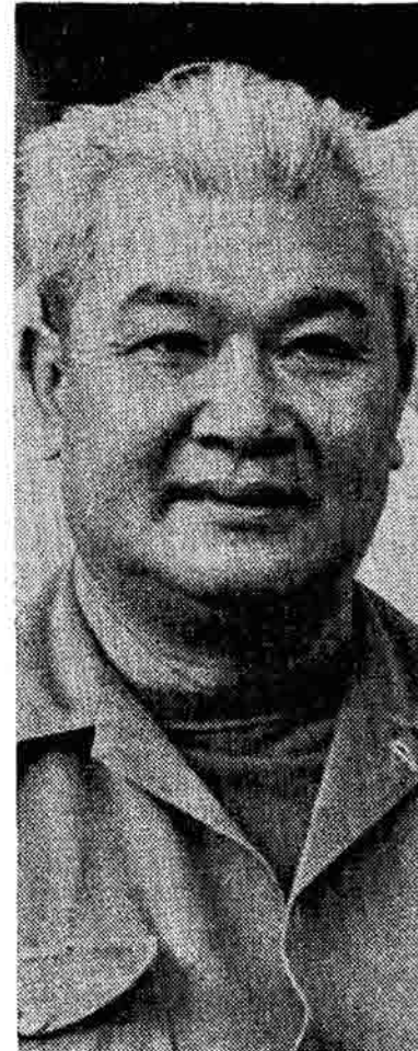
Prince Boun Oum, described as a "clown" and a "plump sybarite," admits playing fast and loose with the truth about a "communist invasion" of Laos.

A recheck of Texas presidential ballots revealed that more than 100,000 votes were not counted.