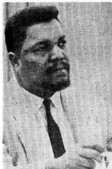
Robert F. Williams

The President of the North Carolina NAACP was in his opinion little better than an Uncle Tom, currying favor with state officials and avoiding militant struggles against Jim Crow. He recalled how he had been unable to get the state organization and the national office's field representation to furnish legal aid for his branch and the parents of the children in the Kissing Case at the