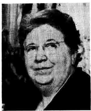
Elizabeth Gurley Flynn

Officials have justified the ban on the basis of Washington's drive to outlaw the Communist Party. The government is demanding that the organization expose its mem-