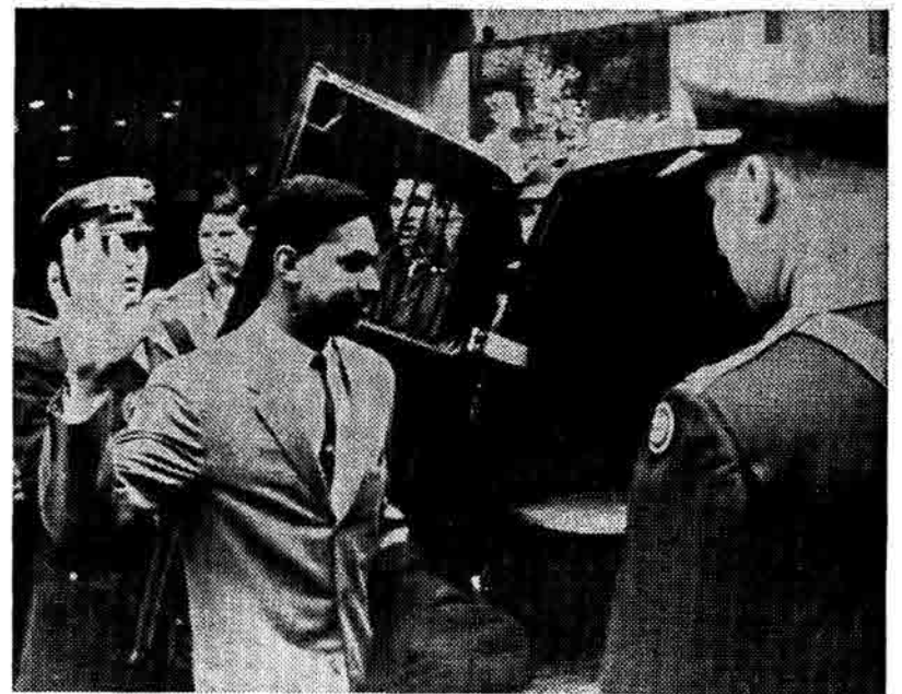
STUDENT IN RICHMOND, VA., being arrested on Lincoln's birthday for lunch counter sit-in. Should not civil-rights struggle be part of subject matter in school courses on "building democracy"?

1) "We have to have a clear commitment from the Board of Education that this supplementary