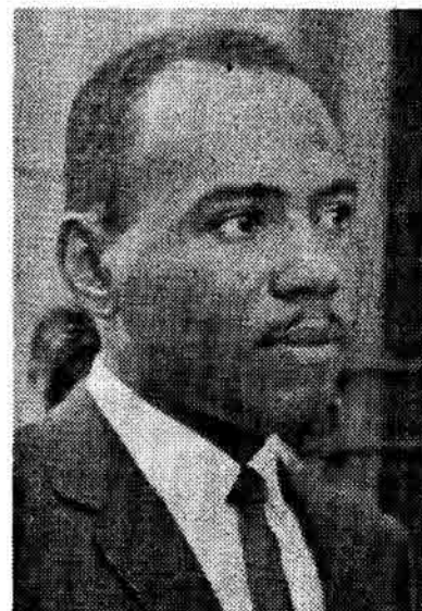
James H. Meredith

"It is true that a number of officials charged with the administration of the University have not met their responsibilities," he said. "It is incumbent upon them and state law-enforcement officials to make it possible for Mr. Meredith to continue his education without interruption. I would hope