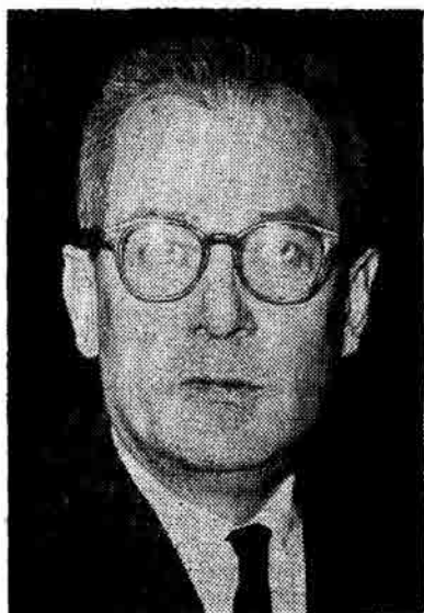
Sec'y of Labor Wirtz

1) The determination of the pickets who have been marching 24 hours a day, seven days a week, before the entrances of all the struck and locked-out papers in this city in the foulest weather in many years.