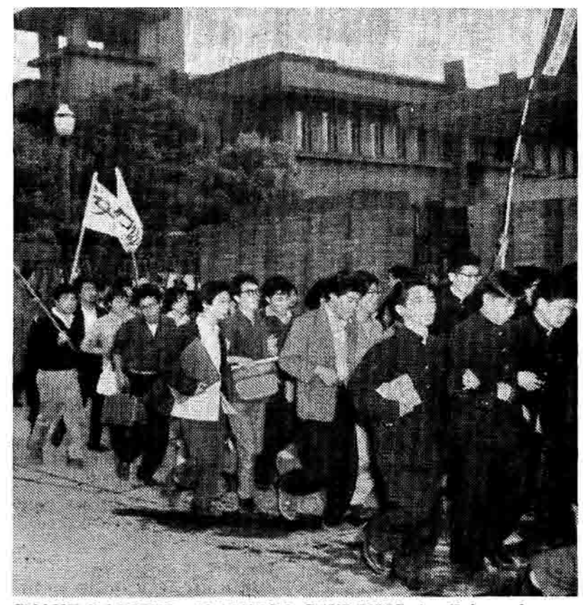
SNAKE-DANCING JAPANESE STUDENTS in Tokyo demonstrate against U.S. remilitarization of their country. Protest action was called by Zengakuren, prinicpal Japanese youth organization.

with American imperialism - a struggle in the course of which even Blanquist tendencies sprang up - the Zengakuren played a very important role And its action made even more strikingly apparent the absence of a true revolutionary leadership and the opportunist, "left parliamentarian" character of the Communist Party and Socialist Party. These two had transformed the peace movement into a petty-bourgeois pacifist movement and attacked the Zengakuren students, treating them as "Trotskyist provacateurs." But after the struggle of June 1960 there was a new crisis within the Zengakuren leadership which had manifested Blanquist and petty-bourgeois tendencies. The Communist League dissolved quickly enough and while passing through many experiences the majority were won over by the National Committee of the Revolutionary Communist League or were directly influenced by it. Q_{.} — What is the Zenjiren, the student organization led by the Japanese Communist Party? A .- Hostile to the revolutionary activity of the Zengakuren, the Japanese CP has always tried to split the student movement. When, after animated discussions with the supporters of the Revolution-