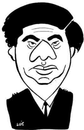
Ngo Dinh Diem

All of Washington's hypocritical denials can barely conceal the establishment, by the Kennedy government (Feb. 1962), of an American military command in Saigon.