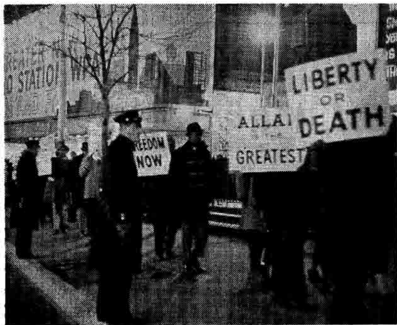
DEMAND RIGHTS. Black Muslims demonstrate in New York's Times Square to establish their rights of free speech and assembly. They have been object of police abuse in a number of cities.