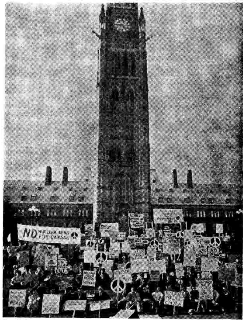
OPPOSE NUCLEAR ARMS. Anti-bomb pickets demonstrate in front of House of Commons in Ottawa. Strong opposition to nuclear arms has deepened rift between U.S. and Canada.