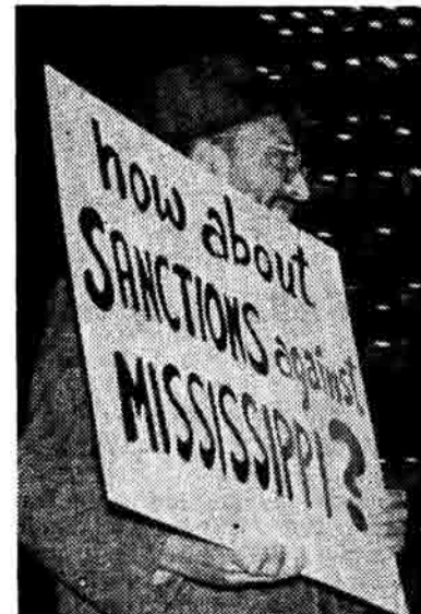
Question posed by picket at UN last year assumes new pertinency with demand of Mississippi's Senator Stennis for quarantine of Cuba.

Another reason is that the liberals have cut the ground out from under themselves on the Cuban issue. They fed the hysteria and encouraged the right-wingers by supporting every anti-Cuba move. A recent example was the out-