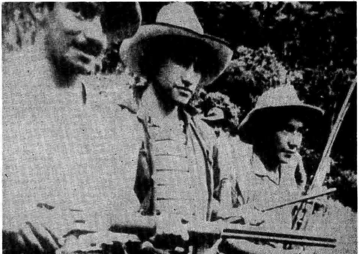
PERUVIAN FREEDOM FIGHTERS. Hugo Blanco (center) leads the peasant struggle for land reform. Photo was taken in Cuzco province where the guerrillas are based.

recruited at gun point. Since it is made up principally of workers and campesinos , the oligarchy, which is at the service of imperialism, uses this army only when it has no other recourse, for it does not trust the soldiers. When forced to use the army the regime does so by transferring the units from their home bases, that is, those from the north are moved to the south, and vice versa. This situation forces the government to rely more frequently and from the very start of trouble on the Civil Guard, a political group, as a repressive force.