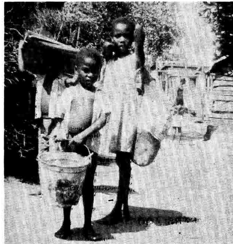
IN PATH OF BULLDOZER. These children live in shantytown in Kingston, capital of newly independent Jamaica. But homes their squatter parents put up are being bulldozed by government without any new housing being made available for them. Though homes are shacks without plumbing or utilities they at least provided shelter.

At present 45 per cent of the country's farm lands are owned