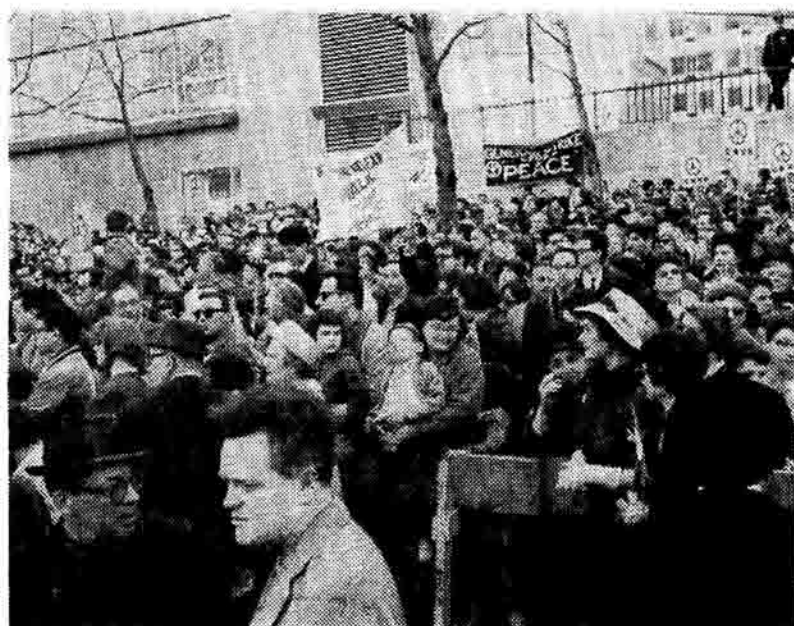
Militant Photo by Jack Arnold

In the face of the barrage of brain-washing, The Militant stands almost alone in the newspaper field. It digs for the facts and re-