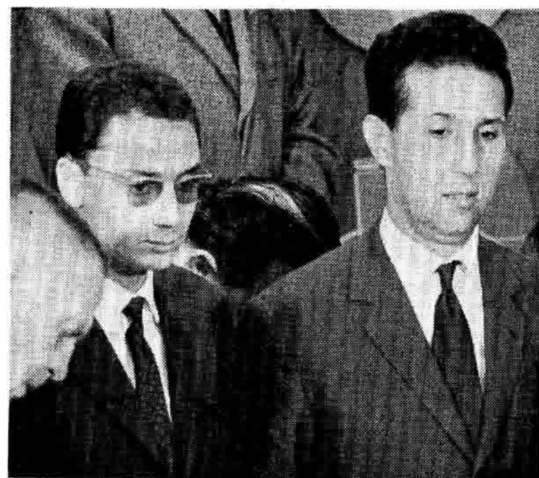
DURING NEW YORK VISIT. Shown at left with Algerian Premier Ben Bella during Idlewild Airport press conference last fall is Foreign Minister Mohammed Khemisti, 33, who was shot in Algiers April 11 by an apparently crazed assailant. Doctors say there is no chance of his recovering.

Speaking about the need to build the FLN (National Liberation