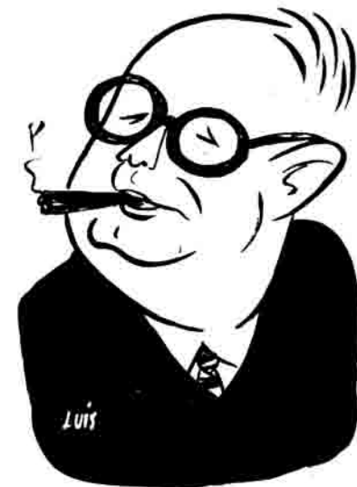
JAMES O. EASTLAND, the Democratic Party U.S. Senator from Sunflower County, Mississippi.

October 10, Columbus, Lowndes County: A "Molotov cocktail" was