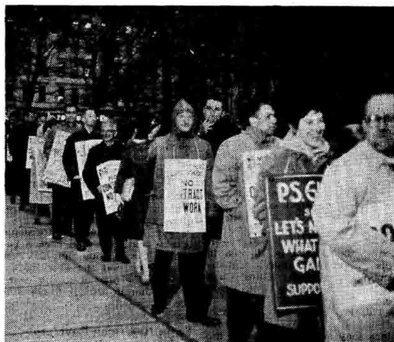
NIGHT SCHOOL. Part of all-night vigil staged by New York teachers at City Hall May 5 to press demand for improvement of school conditions for teachers and students. Earlier in day several thousand teachers turned out for mass demonstration. For more on this, see item in The National Picket Line column, page 2.