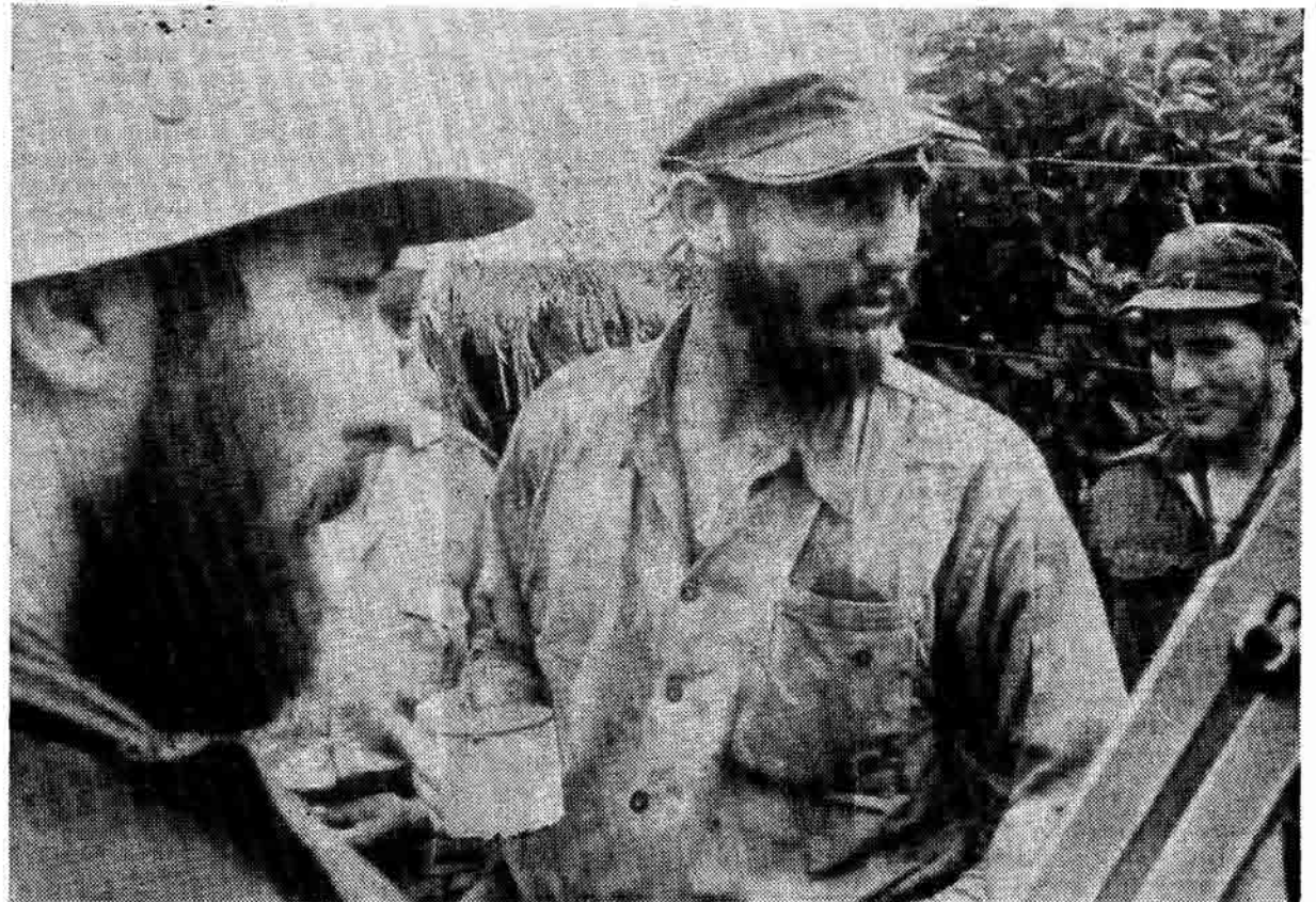
KEY STAGE IN REVOLUTION. Fidel Castro and companeros during period of guerrilla warfare in Sierra Maestra. At left is late Camilo Cienfuegos, a hero of the revolution who died tragically in an airplane accident in 1959.

[The Havana newspaper Revolución published the following statement by Premier Fidel Castro on its front page April 16, the day it announced he would visit the Soviet Union. The statement is taken from an interview Castro gave to members of the Chilean Instituto Popular on July 31, 1962.]