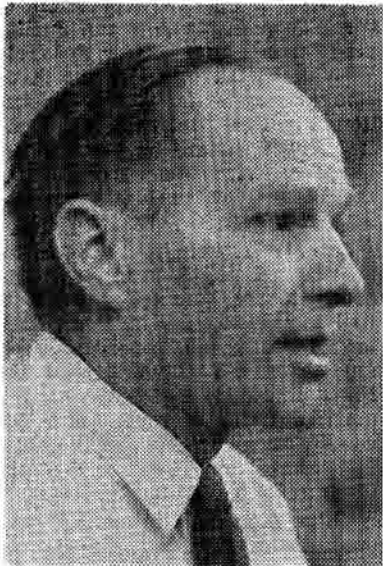
DAVE DELLINGER is a left-wing pacifist. He has participated in many peace walks, vigils, fasts and other anti-war actions. He is an editor of Liberation magazine.

Just look at the history of recent times, say since the Second World War. There were those in the capitalist world who planned to start the Third World War as soon as the second one was over. That's why Hiroshima Harry dropped the atom bomb on Hiro-