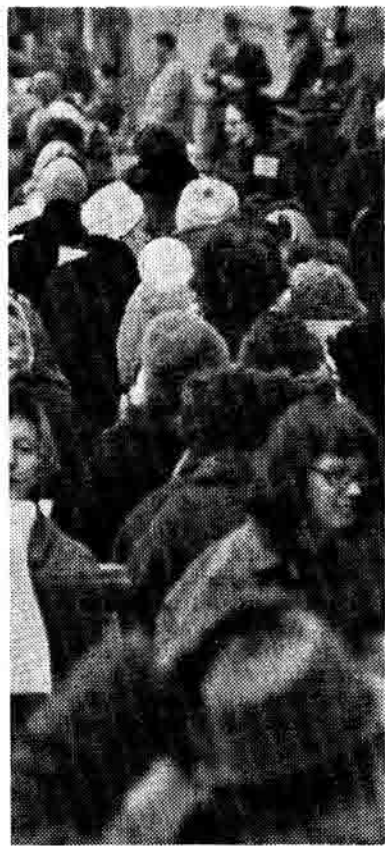
ike for Peace anti-bomb dem-

balance of terror, who favor the atom bomb, in the labor unions and in CORE and in the organizations that perhaps you would all refer to as left-wing as there are in the National Association of Manufacturers or in the Rotary Club or in the Catholic Church, the Unitarian Church or any other group. We are all human beings and I think we have to stop blaming it on some, what would be the opposite of the pie-in-the-sky, some devil-in-the-sky to whom we apply this tag of exploiters . . . .