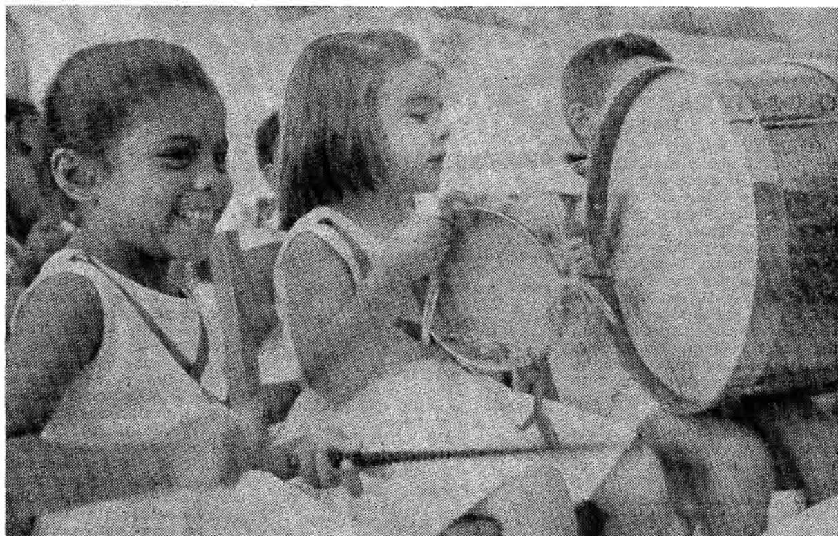
MUSIC TO WARM YOUR HEART. Budding performers at nursery for children of working mothers in Santiago de Cuba. Such nurseries are being established throughout Cuba and are completely integrated. From the time it came to power, the Revolutionary Government of Cuba has moved decisively to stamp out every manifestation of racial discrimination.

A. J. Muste, CNVA chairman, last March wrote the tax bureau that his organization would not be an instrument for collecting taxes and that the government would have to do the collecting itself from the individuals involved.