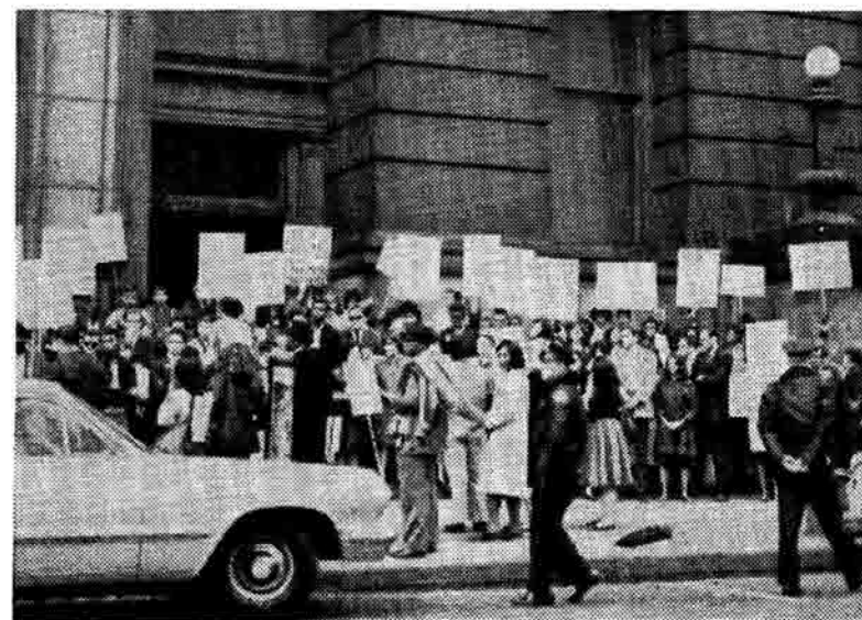
NORTHERN CITIES JOIN FIGHT. Growing numbers of Northern civil rights activists have demonstrated in support of the Southern freedom struggle. Here Chicagoans picket at federal building to protest jailing of SNCC voter registration workers.

The 1963 resolution of the Socialist Workers Party ("Freedom Now," Pioneer Publishers, 32 pp., 25c), points out that while