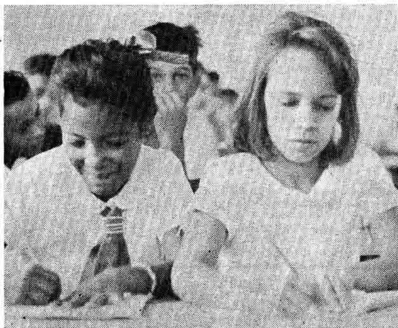
GROWING UP FREE. Since the revolution, Cuban school children are no longer subjected to racist poison. "Segregation is over," reports novelist Graham Greene and everyone enjoys equality.

"Now the children of the dramatic school are eating a free