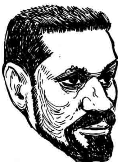
JUAN ALMEIDA, head of Cuba's armed forces.