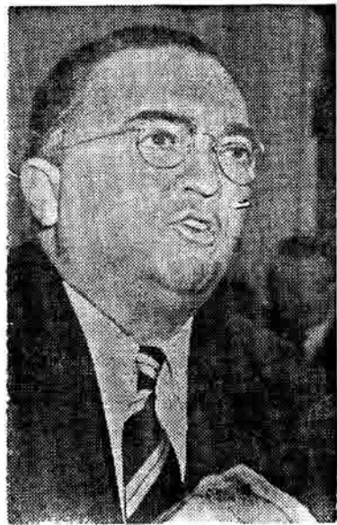
J. Edgar Hoover

Meantime, an appeal for funds is being made for living expenses as well as court costs. The address of the committee to Defend Liberties of Arizona Public Employees is 2648 North Fair Oaks, Tucson, Arizona.