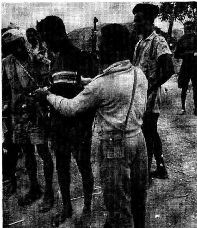
ANGOLAN FREEDOM FIGHTERS. Recruits to Angolan guerrilla forces fighting to rid their country of Portuguese tyranny. For current information on that struggle see report, page 8.

Serious doubt was cast on alleged statements by Oswald's wife by the Dec. 21 Times . It reports that she still is, in effect, "being held incommunicado by the Secret Service for the Department of Justice" (Continued on Page 5)