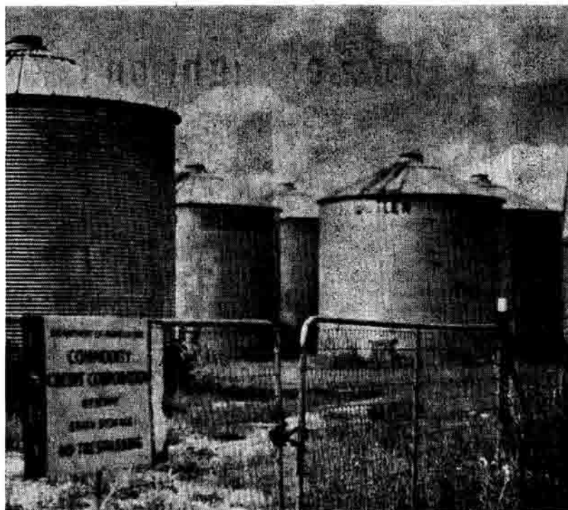
AMERICA'S CONTRADICTION. While millions throughout the world go to bed hungry at night, bins like these, bulging with surplus grain, dot the U.S. landscape. Now Washington has finally decided to sell some of the surplus wheat to the USSR. For cold-war reasons it still refuses to sell to China.

Khrushchev again tried to get around the difficulty instead of solving it. He launched his campaign to turn to the "virgin soil" of Siberia and Kazakhstan. Huge