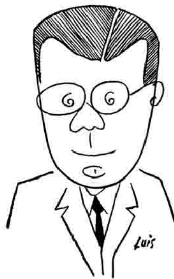
Sec'y of Defense McNamara

There was also an efficiency angle to his trip. President Johnson said at his Dec. 7 press conference that McNamara's trip to Vietnam was nothing to be concerned about. It was "just to make