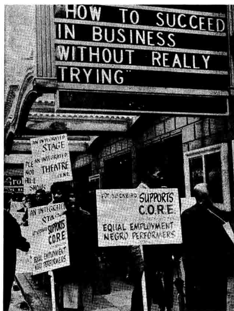
BROADWAY JIM CROW. These pickets protesting Broadway producers' hiring practices, which exclude Negroes completely or relegate them to stereotyped roles, points up one of the ugly products of the American commercial theater. Investors in shows don't want to keep those with racial prejudice from the box office.

To bridge the gap between private art and commodity art, sub-