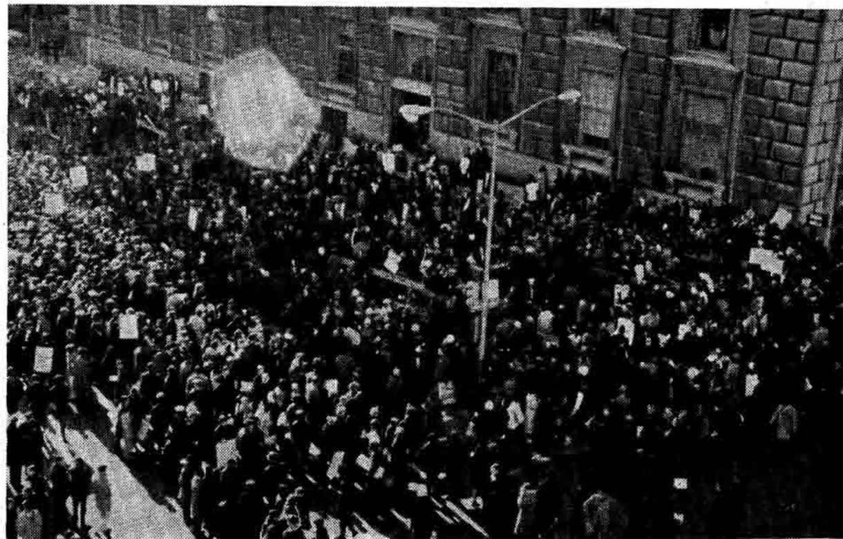
RIGHTS RALLY. Part of the crowd of New York students and supporters who massed at the Board of Education building in Brooklyn during school boycott to demand an end to Jim Crow education.