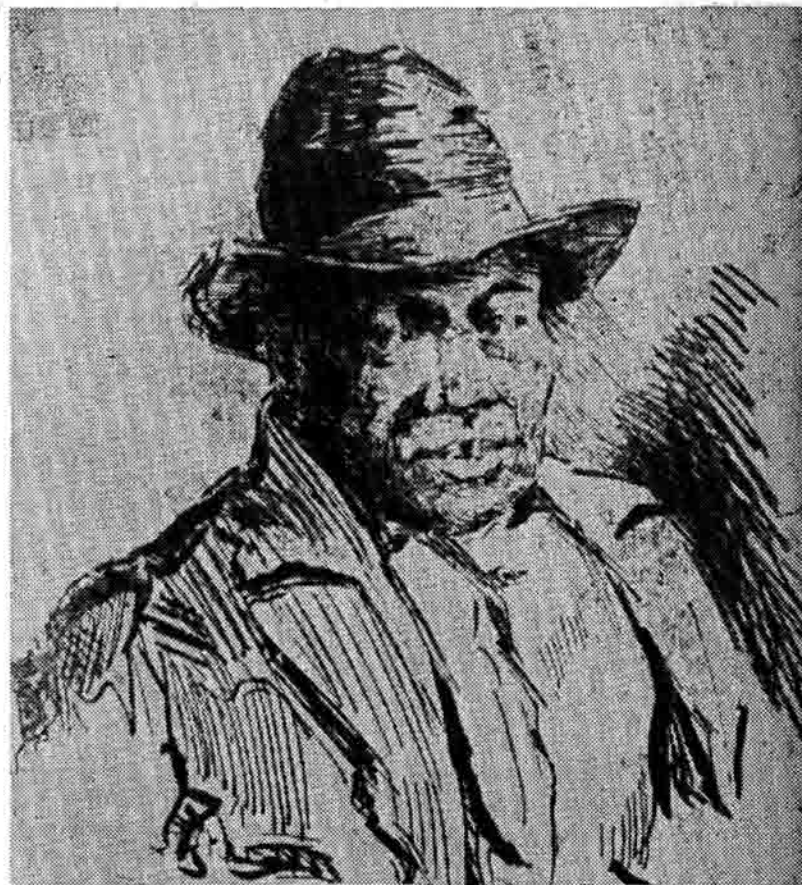
NAT TURNER (1800-1831). Commemorating Negro History Week, we are offering a free 8x10 print of this picture with each one-year subscription (new or renewal) to The Militant . Or, if you prefer, you may select a print of Frederick Douglass, Harriet Tubman or Sojourner Truth. A combination subscription to The Militant and International Socialist Review brings you all four.

The next day, hundreds of students gathered, including some from nearby Campbell and Tougaloo Colleges. Members of the Student Nonviolent Coordinating Committee reportedly urged a march on the county courthouse, where Byron de la Beckwith is being tried for the murder of Medgar Evers before a lily-white jury. NAACP head Charles Evers, brother of the murdered man, persuaded the students not to march.