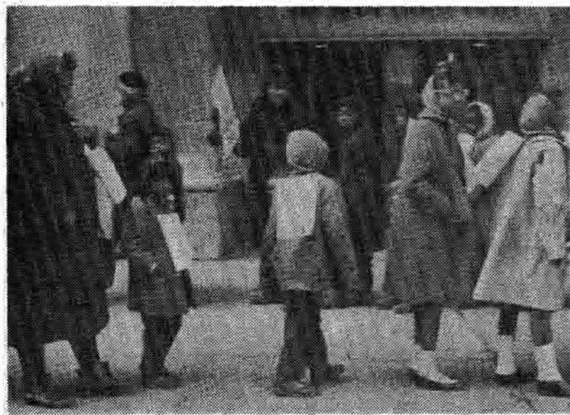
Militant

To prevent the next one, the Times reports, Mayor Daley's Democratic administration has enlisted the active support of Rep. William Dawson, the conservative Negro Democrat from Chicago. But despite Dawson's pressure in the Negro community, militant elements, including the Student Non-violent Coordinating Committee, are still pressing for the school shutdown.