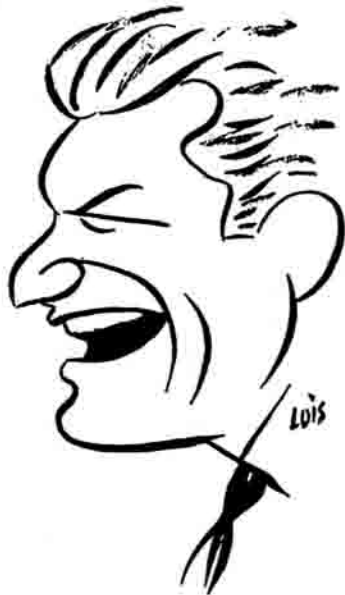
Rockefeller He promised a probe