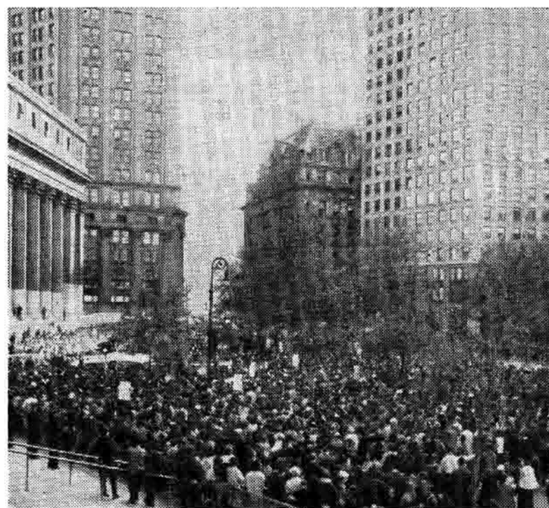
NEW YORK MEMORIAL. Part of crowd of 10,000 that gathered at Federal Building in New York last fall to mourn murdered Birmingham children. Government failure to prevent such acts of racist terror is serving to deepen black nationalist sentiment.

plains, contains the verdict that the "American Way of Life" has nothing to offer Negroes. "The urge to tear loose and separate from the social fabric of U.S. capitalism is not far removed from the urge, under different forms, to abolish that system in revolutionary struggle."