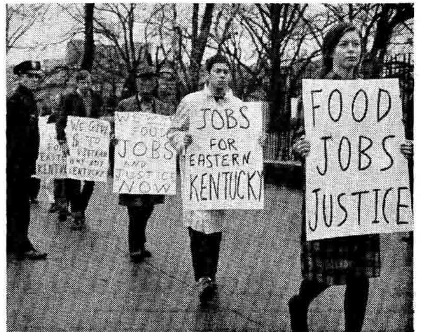
BUT WHO'S FIGHTING? While President Johnson has been talking a lot about a war on poverty, these miners and their student supporters were refused an interview with the President. They had come to convince Johnson of the immediate need for food, jobs, and justice in Eastern Kentucky.

The war of words is certainly well launched, but action to suit the words is hard to discern. Since President Johnson's State of the Union message there has been a veritable deluge of articles on poverty in the U.S. Life magazine, The Post , Newsweek and a host of other magazines and news-