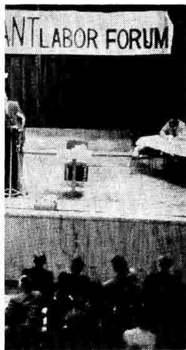
istens to question from audience.

She has colonized 22,000,000 Afro-Americans by depriving us of first-class citizenship, by depriving us of civil rights, actually by depriving us of human rights. She has not only deprived us of the right to be a citizen, she has deprived us of the right to be human beings, the right to be recognized and respected as men and women. And in this country the black can be 50 years old and he is still a "boy."