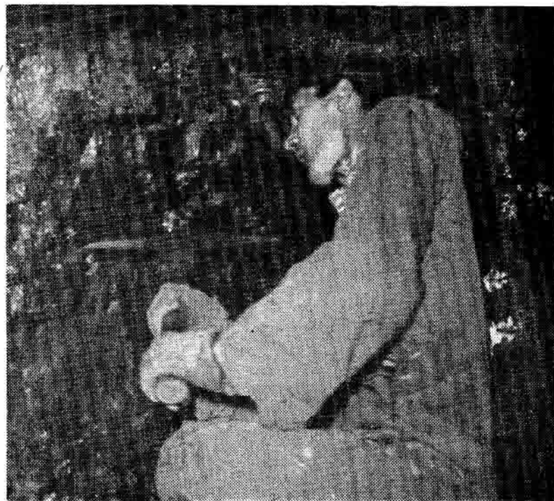
MAN versus MACHINE. As a result of increasing automation in the mine fields of Eastern Kentucky, lay-offs by the major coal companies are forcing miners to work at scab wages in "slope" mines. Following veins into the sides of hills, they often must work on hands and knees in veins no more than 36 inches high.

The truth is that 14 years ago John L. Lewis abandoned a large section of the miners to their fate when he negotiated the first national bituminous coal agreement. It not only paved the way for the decline of the UMW but for the rapid impoverishment of the whole area known as Appalachia. Lewis' agreement gave the operators a