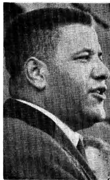
Stanley Branche Chester Civil Rights Leader

It was a big garage. Police cars were parked all around. Police were standing, looking rather foolish with their feet spread apart, holding their sticks, as though looking for more business.