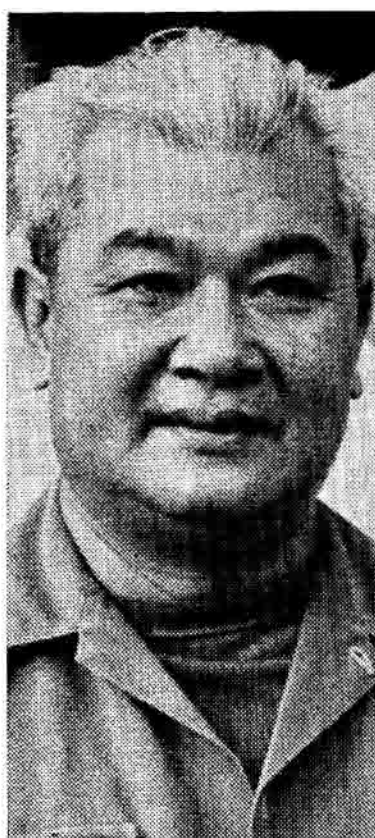
PRINCE BOUN OUM. Corrupt playboy aristocrat was government figurehead for Laotian rightists before 1962 Geneva accords. He is a close associate of right-wing leader, General Phoumi Nosavan.

The "neutral" premier installed by the Geneva conference remains. The "neutrals," however, have now merged with the rightists; all influence of the left-wing Pathet Lao in the government is ended. And the U.S. has a "friendlier" government to work with.