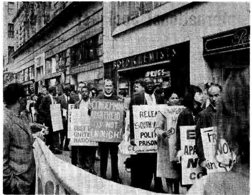
PROTESTING SOUTH AFRICAN APARTHEID. Unionists, civil-rights, church and liberal groups joined together in a protest demonstration at the South African Consulate in New York June 4. From there they marched through mid-town New York for rally at UN. (See story, page 3.)

"As long as people like McNamara, the Ford Company's wonder boy, are running this government the needs of the people are going to take a back seat. That's why we will expose not only the dirty linen of the politicians but the powers behind the politicians. The big money on Wall Street, which has investments throughout the world as well as in the real estate of New York City's slums. It's that big money that really runs the country and the only way to fight it is by the working people, black and white, organizing politically, independently of the parties of the big money.