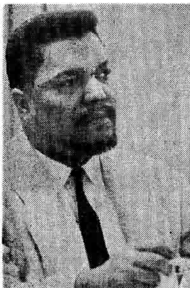
Robert F. Williams