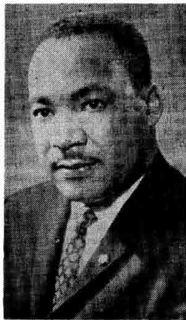
Martin Luther King

Pointing up the acute need of the Negro people for such sweep-