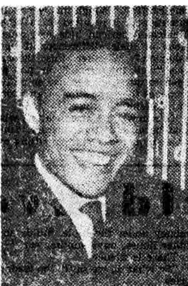
Dr. Neville Alexander

The judge recognized that the defendants are well-known and have high-standing in South Africa. (The press reported a "large