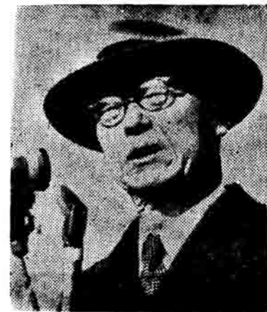
Ex-Dictator Rhee His Successors Are Shaky

"About one fourth of this nation's labor force is unemployed.