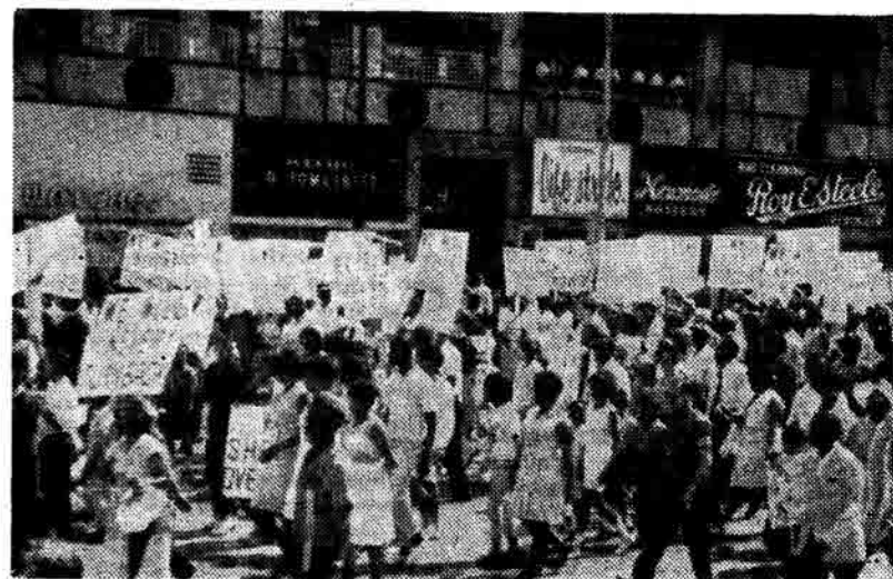
KEEPS SPREADING. Civil-rights demonstration in Dayton, Ohio. The Freedom Now struggle has spread to every major area of the country.