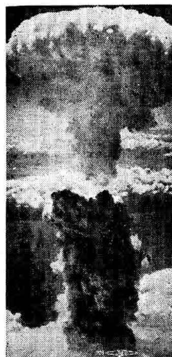
OUT-OF-DATE? Will cheap, deadly, chemical warfare render the bomb obsolete?

This deadly killer is very cheap to manufacture. The Newport plant spends about $3½ million annually — less than the cost of one jet bomber. This plant has been in operation 24 hours a day