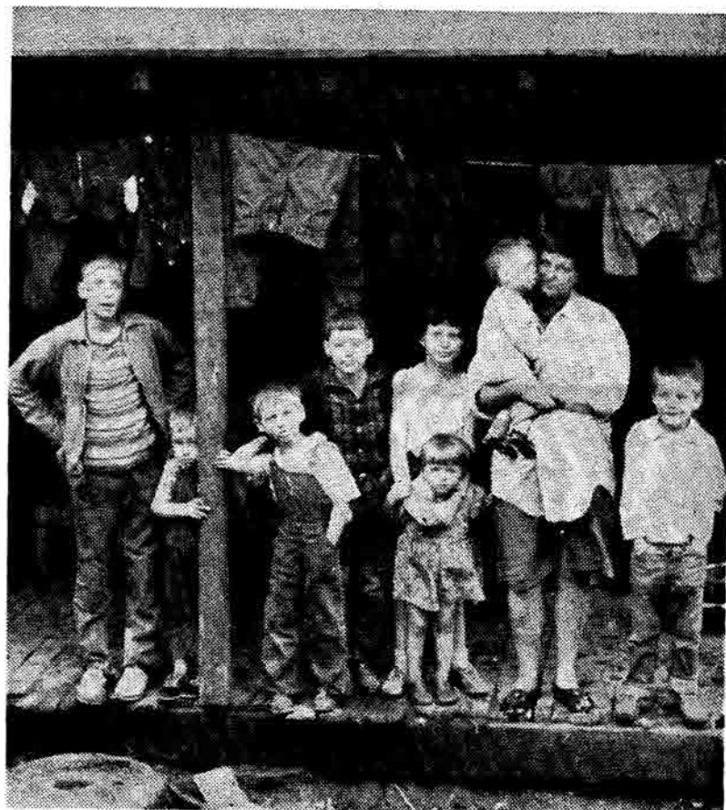
FACE BLEAK FUTURE. Family of unemployed Kentucky coal miner. Small mines in the area couldn't compete with big, mechanized pits and have been permanently shut down.

In other words, the private-enterprise program for dealing with poverty in Appalachia is a pure class program in the interest of