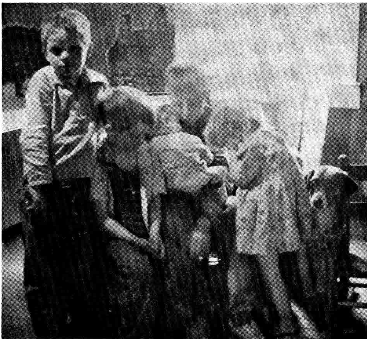
VICTIMS OF UNEMPLOYMENT. Children of jobless coal miners in Appalachia. Mechanization of mining has reduced number of union jobs in coal mines by one-third in past ten years. Most of the displaced miners aren't even counted in unemployment statistics.

1964 — the period which experienced the effect of the tax-reduction program — about 1.3 million extra jobs were created by the expansion of the economy. But that's almost a million short of what would be required each year in the coming period.