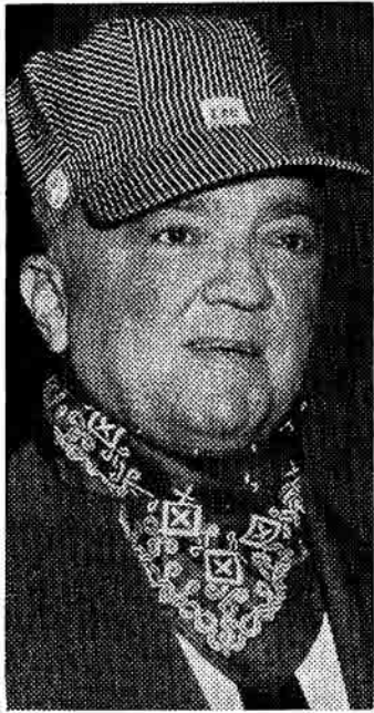
J. Edgar Hoover Fond of Railroad

It is also clear from the whole Hoover press conference, that Hoover is now a political liability. If Johnson allows him to remain, that very fact will be an additional expression of contempt for the rights and feelings of the Negro people.