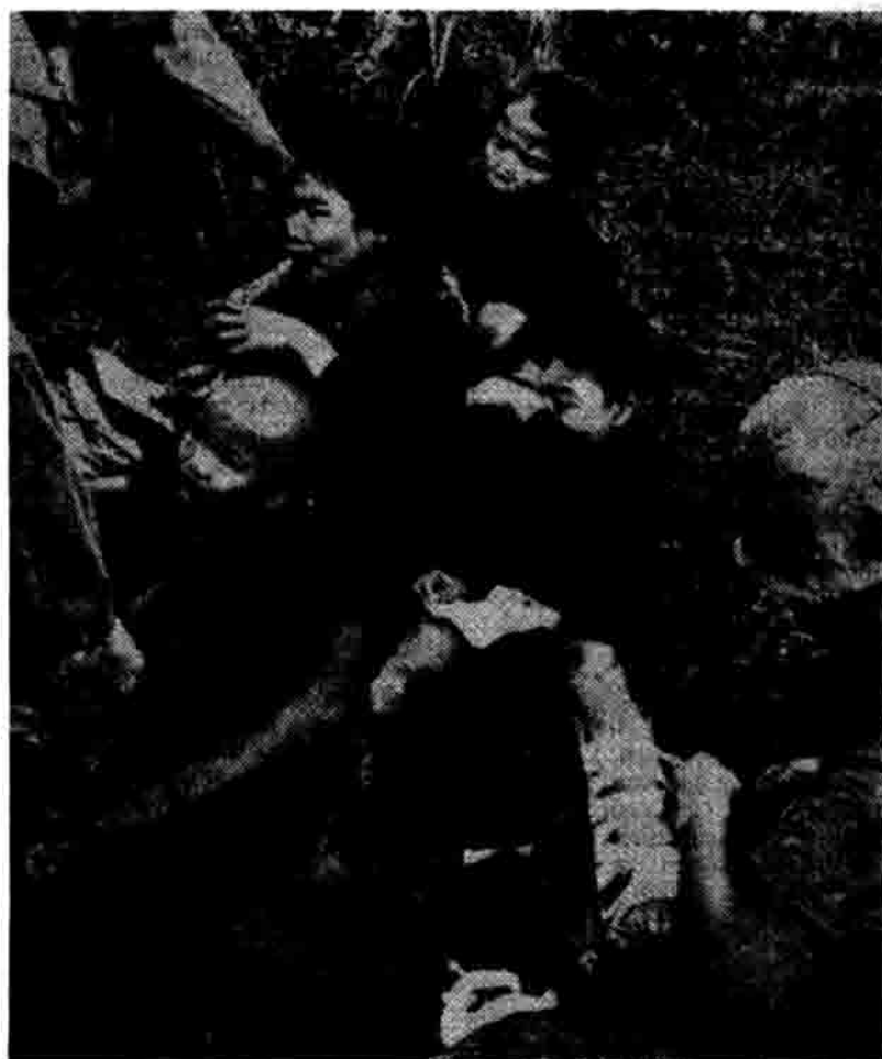
WAR SCENE. GI tries to fix wound of Vietnamese child. Civilians are principal victims of U.S. aggression.

Eugene McCarthy of Minnesota received 450 supporting telegrams and one dissenting phone call when he proposed on Jan. 31 that the Senate Foreign Relations Committee undertake a critical review of Vietnam policy. Walter Mondale, the other senator from Minnesota, who is not a critic of the administration, reports his mail is 6 or 7 to 1 against escalation.