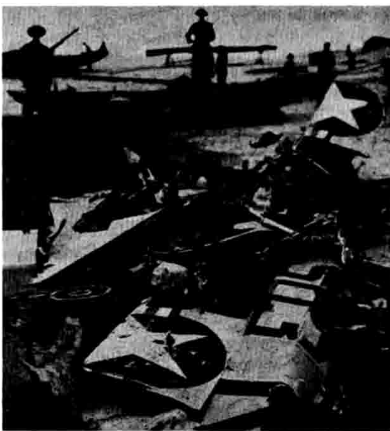
TOLL. U.S. bombing of north Vietnam is not being conducted without price as indicated by wreckage of this shot-down U.S. plane.

While Ky talked about building a 42,000-man "peace corps" to "pacify" the village regions which are seized from the National Liberation Front by huge American