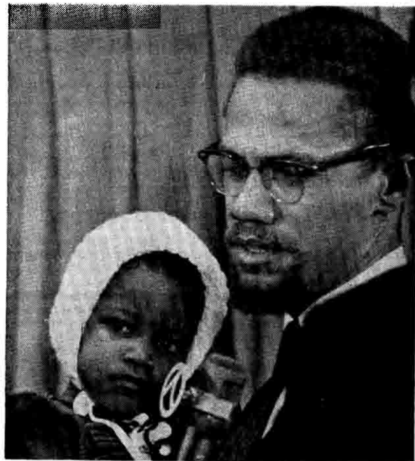
Malcolm X and daughter.

Did they have sufficient time after the two shotgun blasts to run down to the stage? The de-