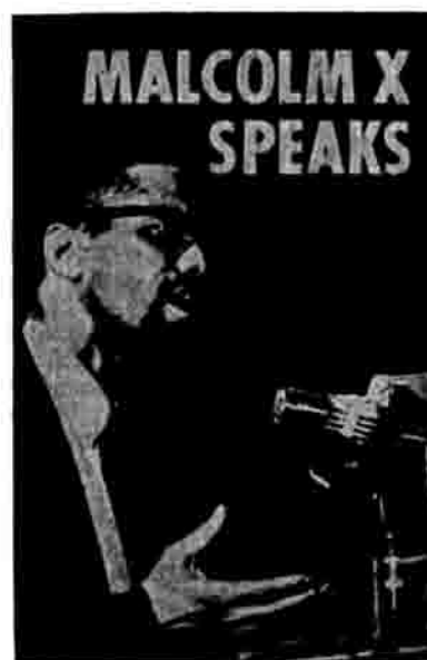
Excerpted from the book, Malcolm X Speaks , with the permission of Merit Publishers, 5 East Third St., New York, N. Y. 10003. Price $5.95. Copyright 1965 by Merit Publishers.

We've got too many of our own people who stand in the way. They're too squeamish. They want to be looked upon as respectable Uncle Toms. They want to be looked upon by the white man as responsible. They don't want to be classified by him as extremist, or violent, or, you know, irresponsible. They want that good image. And nobody who's looking for a good image will ever be free. No, that kind of image doesn't get you free. You've got to take something in your hand and say, "Look,