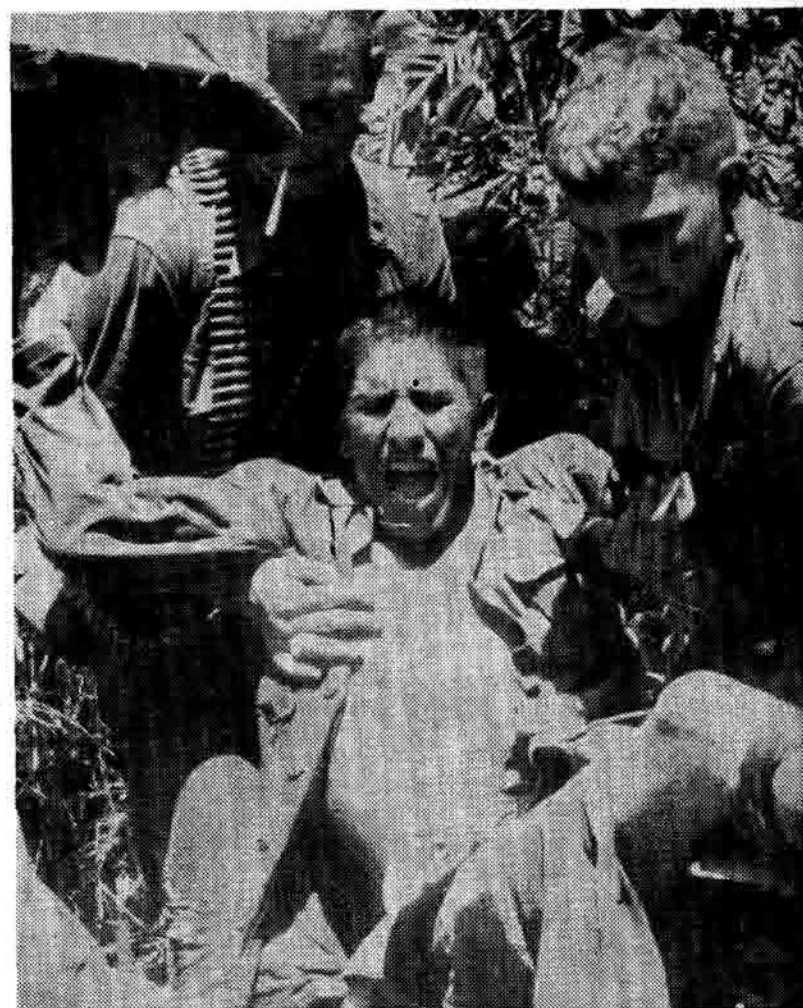
SCREAM OF PAIN. Wounded U.S. soldier is carried by buddies. There have been tens of thousands of U.S. casualties in Vietnam war already. Johnson's plans for war will mean death and mutilation for hundreds of thousands of U.S. men — all for a war which benefits only the rich.

"A guy jumps in a foxhole with you. You know each other's life history in half an hour. But you don't have time to keep track of guy's names over here. You no sooner make friends with someone over here and he's dead. Some-