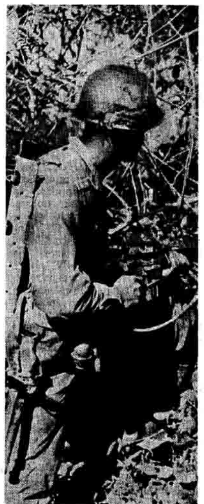
Negro soldier in Vietnam

According to the U.S. News and World Report for Nov. 14, seven out of eight men fighting in Vietnam are volunteers. The fact is supposed to prove that the war is "fair" and "poor boys" aren't being sent there against their wishes. Does it prove that? Or does it prove that the job prospects for non-college educated teenagers is incredibly bad — in other words, precisely the fact that