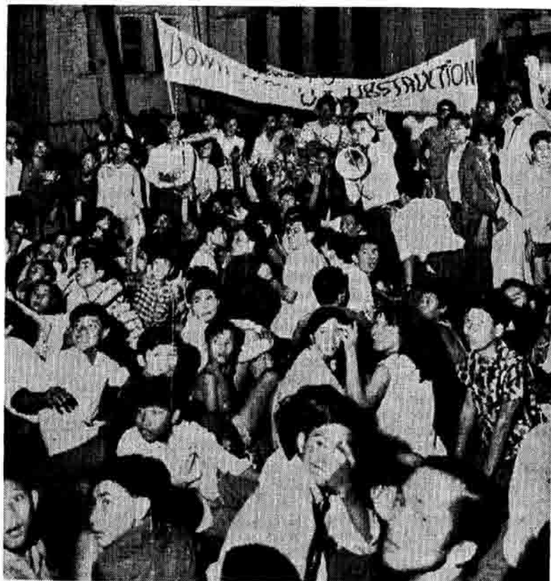
AGAINST KY. Demonstrators last May gave notice to world that people of south Vietnamese cities, along with north Vietnamese people and south Vietnamese peasants, are against U.S.-supported dictator and U.S. war in Vietnam.

In spite of fierce fighting conditions, our people have stuck to their fields, factories, communica-