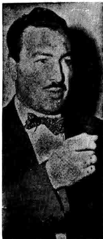
Adam Clayton Powell

qualifications of candidates as well as mechanics of voting.