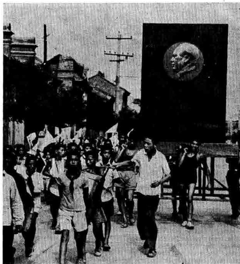
"CULTURAL REVOLUTION"? Youthful Red Guards march through Peking with banner featuring portrait of ubiquitous Chairman Mao.

In any case, the Mao leadership will emerge much weakened from this test. Up to now the masses saw it as homogeneous and strong, standing on the tradition of the victorious revolution. Now, divisions have appeared openly and the wear and tear has proved to be serious. From now on, the leadership will be judged by the