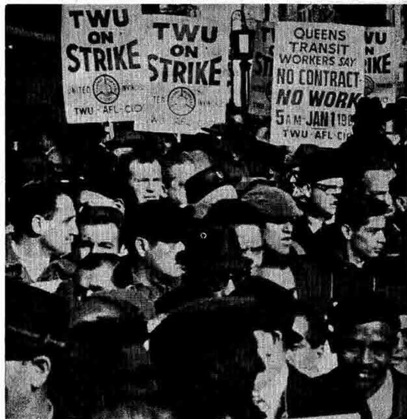
NEW YORK TRANSIT STRIKE. Shutdown of New York city transit early this year in defiance of courts, and similar action later by airlines mechanics, were symbolic of new expressions of rank-and-file labor militancy.

Looking at the union situation in its entirety, some analysts — who tend to dabble in supra-class "theory" — conclude that the working class has exhausted its role as a vital social force. Those who would so lightly dismiss the working class from political consideration are today getting a partial answer from the workers themselves. The upsurge