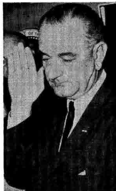
Our Pious President

Of course, all patriotic Americans — an easy-come-easy-got — will laugh off this error as a big joke on Johnson and dig up the change so their well-meaning and usually nimble-fingered president won't be stuck with it.