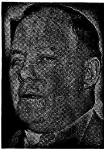
"NEVER WALKED A PICKET LINE." George Meany made this boast shortly after merger of AFL-CIO.

During the last three years, AFL-CIO unions have made a slight comeback by recruiting about one million new members. A large part of the recruitment can be attributed to the increase in employment since 1963, especially in basic manufacturing. Another part has resulted from some unionization of government workers and increased organization of teachers. This recruitment has brought current AFL-CIO