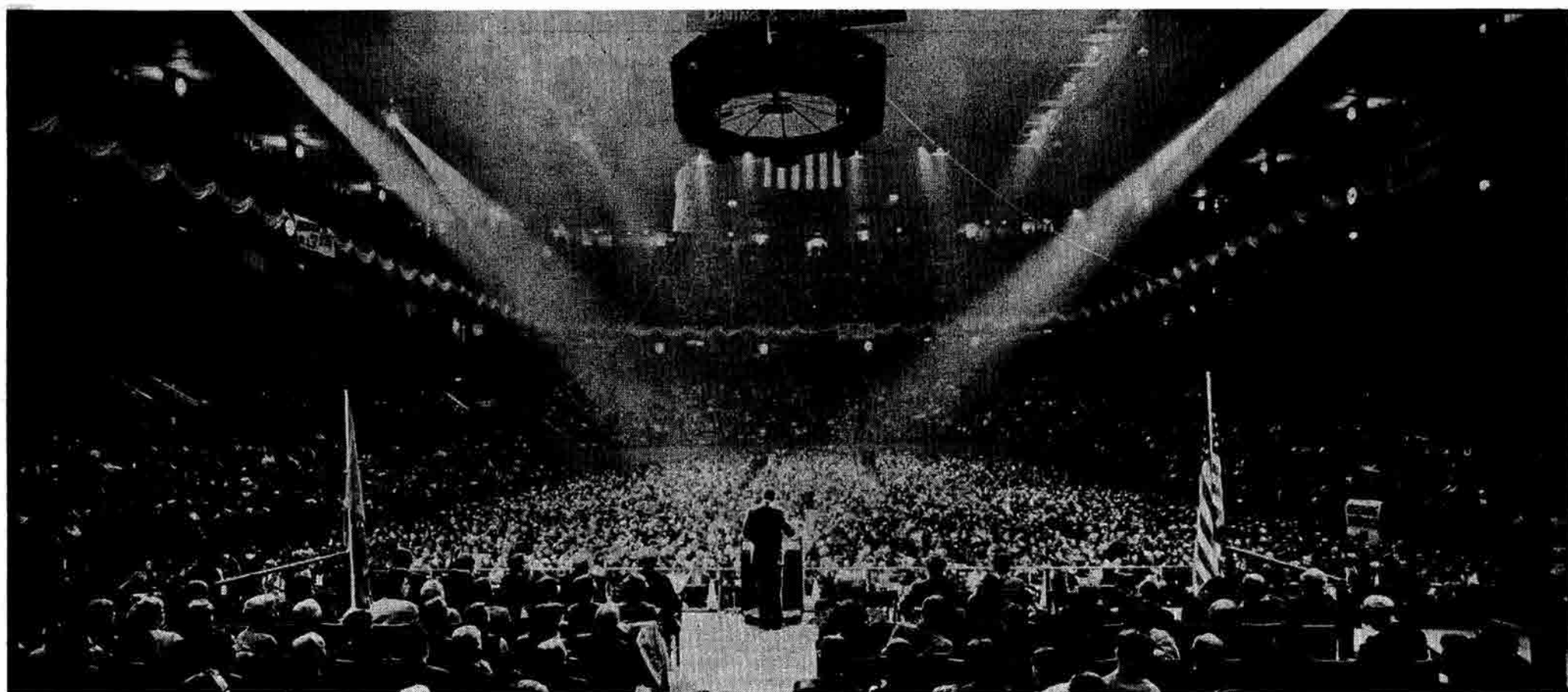
A View of Dec. 8 SANE Madison Square Garden Rally to End the War Now.