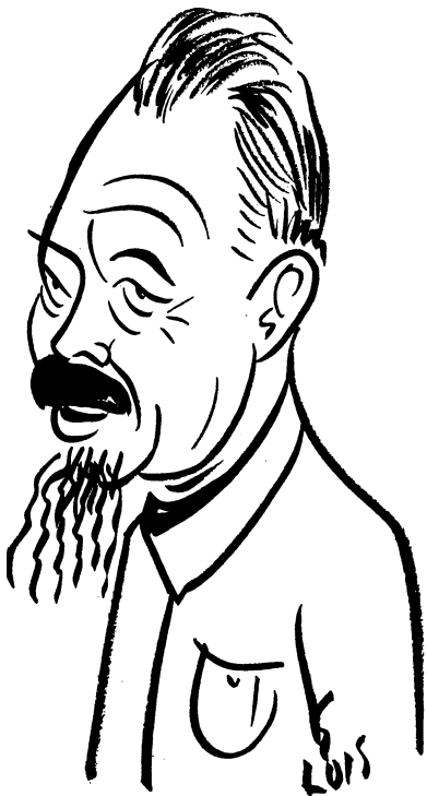
Ho Chi Minh

On each one of these points, the north Vietnamese premier reminds us, the Pentagon's military plans have failed. The strength of the NLF is growing, not declining; pacification — as many top U.S. officials now admit — has been a fiasco; the Saigon regime has no popular support and its army is collapsing; and it has been im-