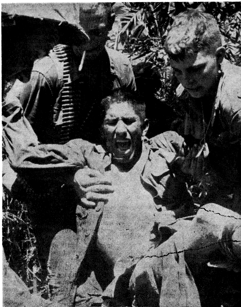
WOUNDED SOLDIER. Working class sons are bearing brunt of sacrifice in Vietnam. Impact of Vietnam war on workers brings death and mutilation of working class youth on the battlefield. It brings inflation, and government and company policies directed against unions at home.

Although Reuther has no answer to the problem, he does inadvertently expose the bureaucratic tumor lodged in what is alleged to be the brain center of the labor movement. This is especially so in his letter to locals of the United Auto Workers, issued Dec. 29 on behalf of the executive board. Meany emerges in the letter as a dictator who, in disregard of industrial union views within the AFL-CIO Executive Council, has centralized all policy direction in his hands on the basis of old-line craft union conceptions. As against this, Reuther calls for sharing of leadership responsibility through "... creative, frank and meaningful dem-