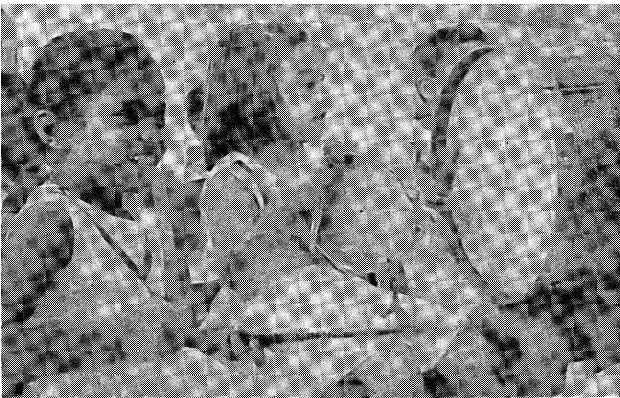
CHILDREN OF CUBA. Some of the most impressive gains of the Cuban Revolution have been in the areas of health, education and ending racial discrimination, which have benefitted the children and made their future brighter than for the rest of Latin America.

• Seven thousand teachers a year are now being trained.