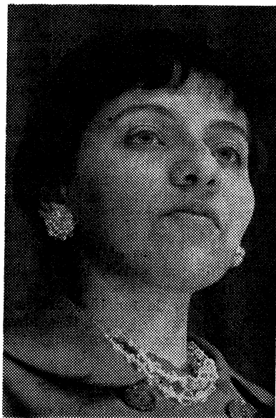
Diane Nash Bevel