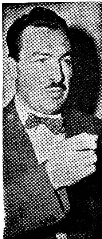
Adam Clayton Powell

The move against Powell is a manifestation of naked racism. The offenses that he is accused of pale in comparison with the crimes of other politicians in Washington.