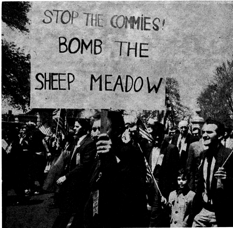
CIVIL LIBERTARIAN. Pro-war demonstrators want to keep GIs in Vietnam — for "democracy" and "freedom."

position of the parade organizers and the smear-propaganda they had directed against the antiwar movement, was the tar and feathering of an unfortunate bystander.