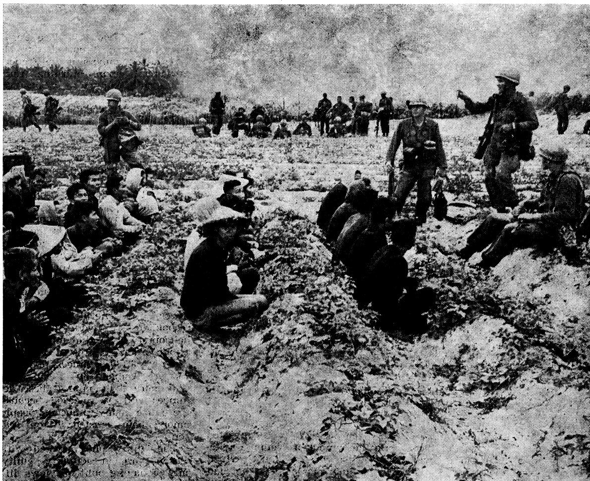
PACIFICATION. Civilians rounded up after "search and destroy" operations, en route to mass concentration camps.

prompting de Gaulle to ban the tribunal from holding its sessions in France as originally planned.