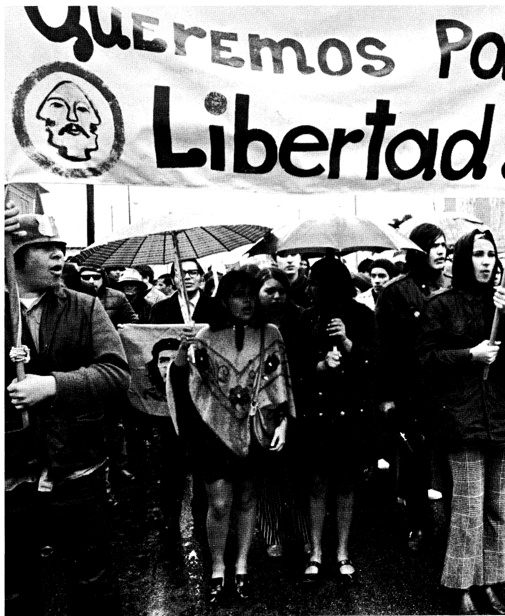
Los Angeles, Feb. 28—Chicano Moratorium demonstration

Now in Texas they have been able to accomplish a tremendous amount. They haven't solved all of the prob-