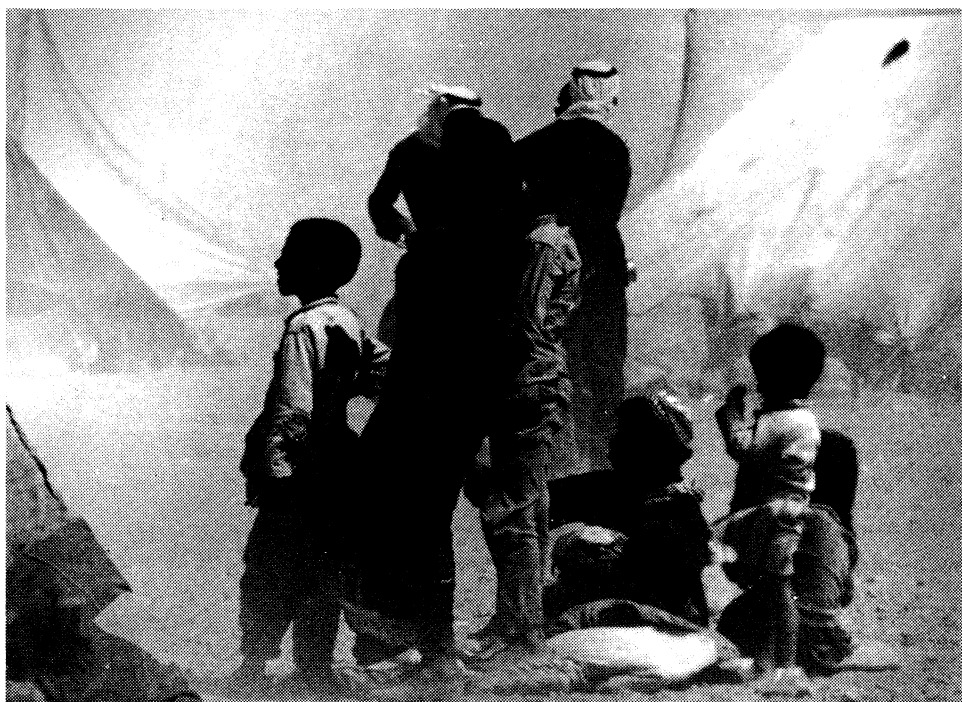
Palestinians in refugee camp

It took a full generation for the Palestinian people to recover from that ter-