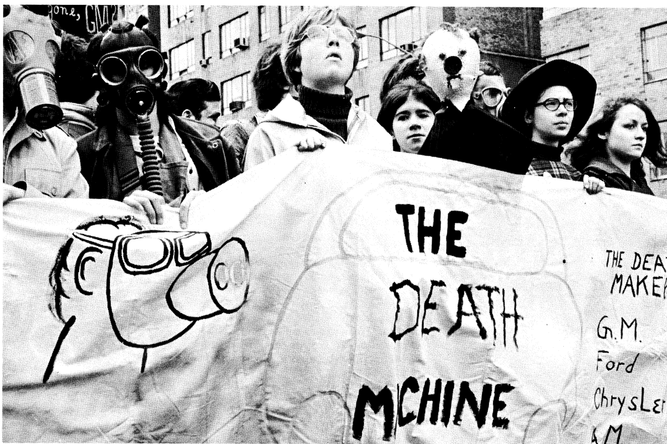
April 4 antipollution demonstration in New York

Pete Seeger and a recently formed "ecology rock group," the Smuggs, provided entertainment.