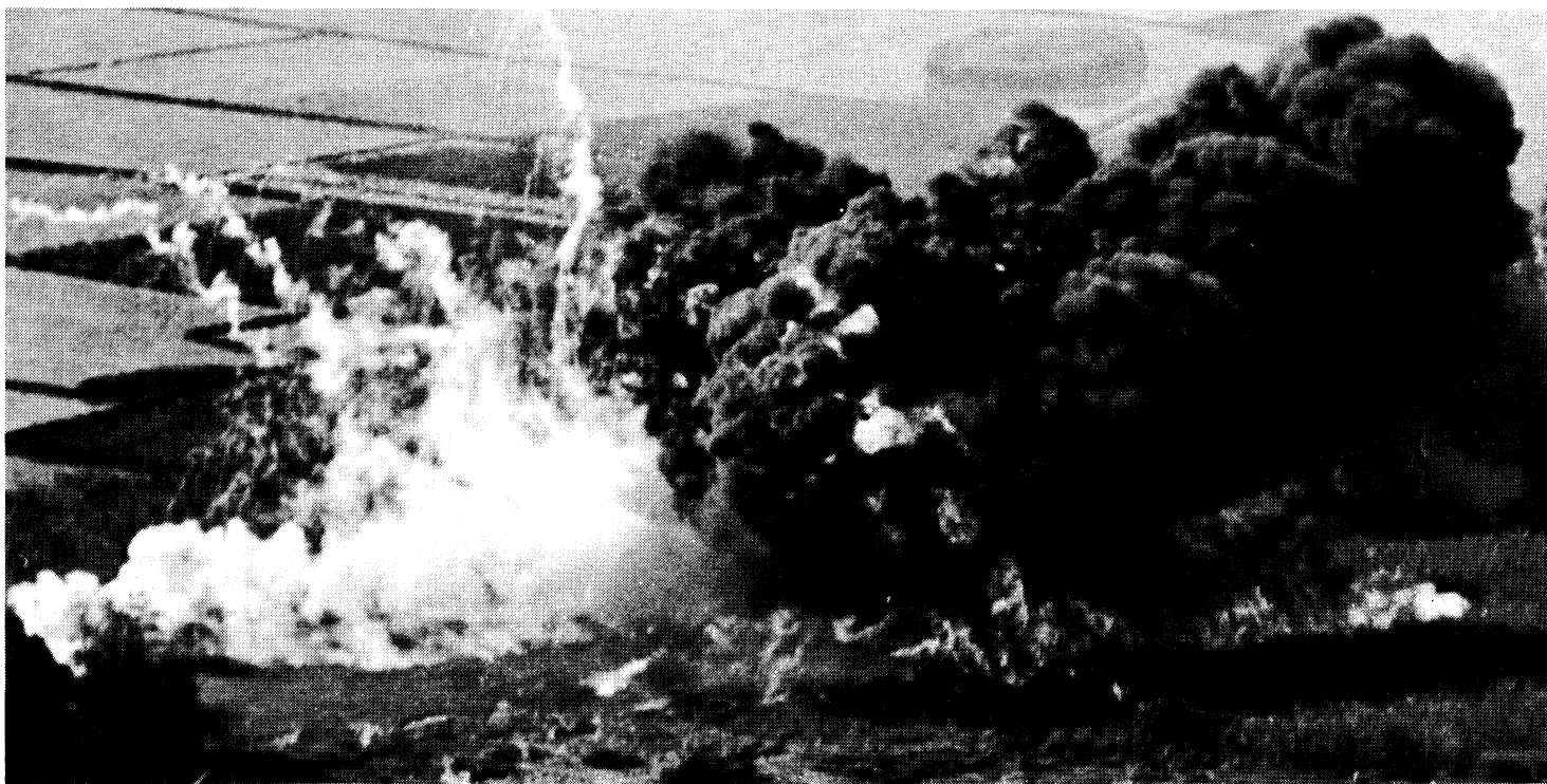
U. S. napalm bombing of South Vietnam, Dec. 2, 1965.

Step-by-step, the motion is toward wider war. This puts additional pressure on the American capitalist class. They risk once again setting into motion the powerful mass antiwar opposition at home.