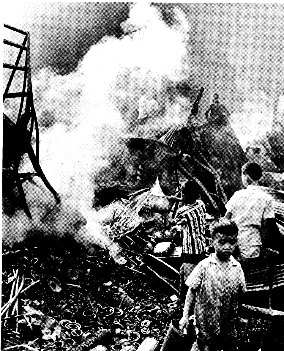
Children's bucket brigade in section of Saigon bombed by U.S. planes, February 1968.

For information and arrangements, contact Committee of Kent State Massacre Witnesses, c/o Cleveland Area Student Mobilization Committee to End the War in Vietnam, 2102 Euclid Ave., Cleveland, Ohio. Tel: (216) 621-6516. Money is urgently needed.