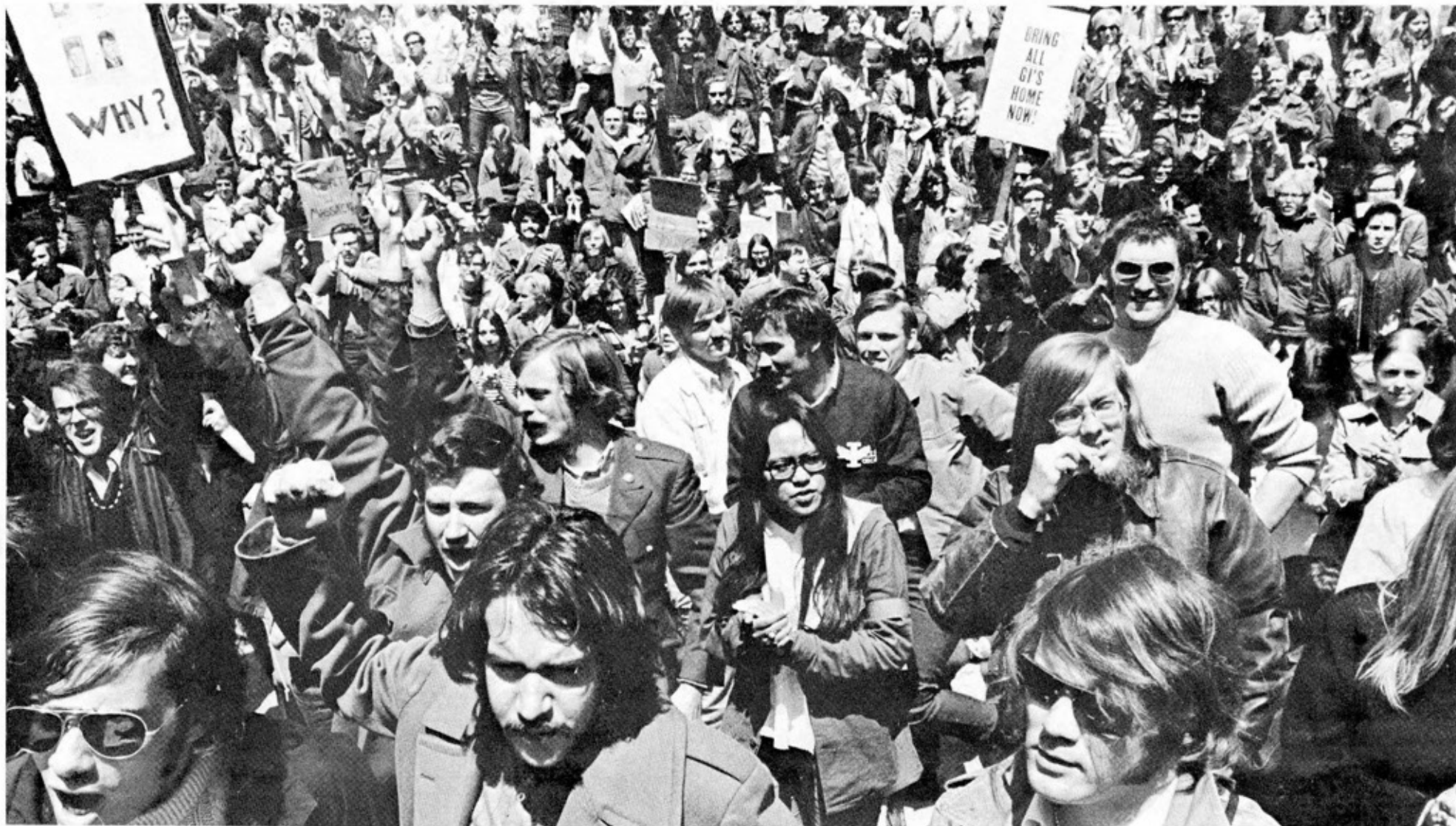
Mass rally at University of Illinois, Chicago

Bring all the GIs home from Indochina NOW!