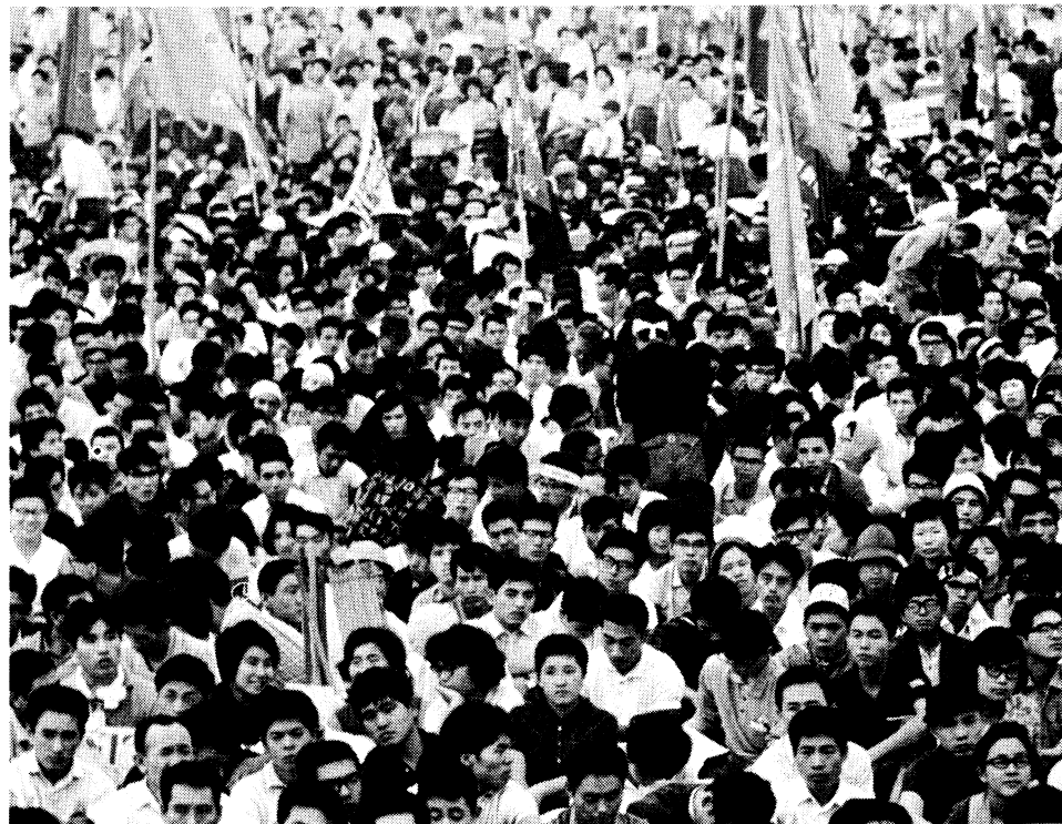
From the beginning of the war, Japan movements have protested U.S. aggression. Here, union demonstrators in Tokyo.

Now available (Publication date, May 19)