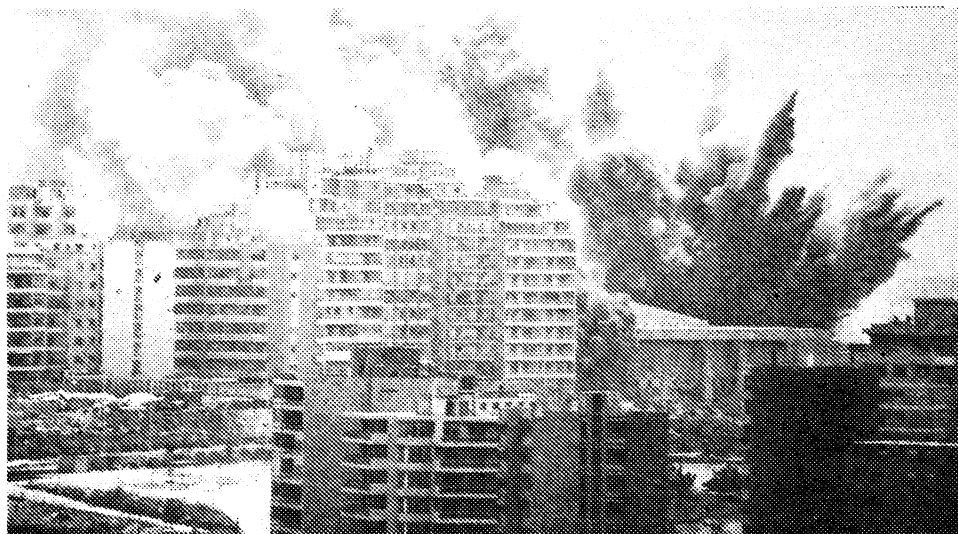
West Beirut. Israel unleashed worst bombing since Vietnam.

Reagan sends bombs, tanks, 'peacekeeping' force