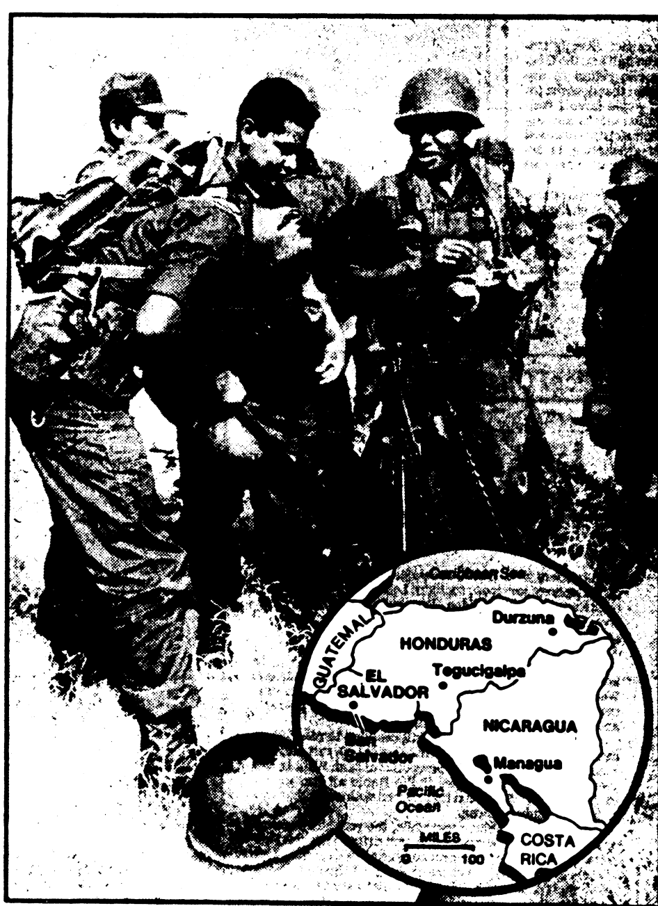
Honduran soldiers in joint military exercise with U.S. troops near Nicaraguan border.

The July air raids against oil installations pointed up Nicaragua's vulnerabil-