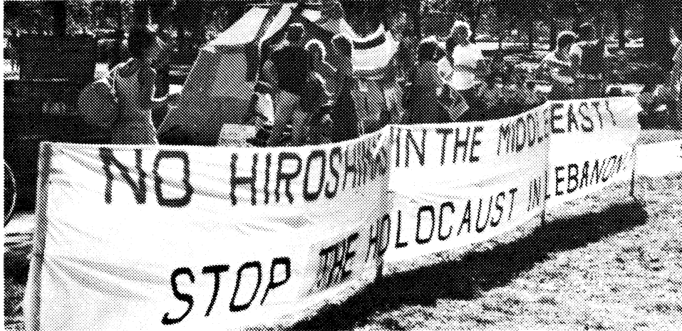
Banner at Chicago demonstration