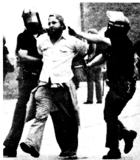
State troopers have gassed, clubbed, and arrested pickets.