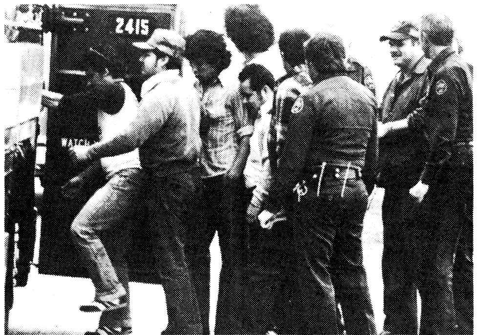
Chicago deportation raid this spring. New bill will increase roundups.

Attacks on the rights of immigrants have traditionally been used to muzzle political dissidents and keep the working class divided.