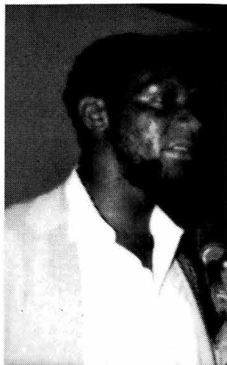
Militant/Holbrook Mahn Neo Mnumzana, chief representative of the African National Congress of South Africa to the United Nations, gives greetings to recent Socialist Workers Party convention.

Neo Mnumzana is the chief representative of the African National Congress of South Africa to the United Nations. He brought greetings to the recent Socialist Workers Party convention and educational conference, which took place August 10-15 in Oberlin, Ohio. The convention decided to make participation in and building the movement against apartheid a central priority of the party. Major excerpts from Mnumzana's speech are reprinted below. In his talk to the 900 revolutionary fighters from the United States and around the world, Mnumzana referred to the speech that South African President Pieter Botha was to deliver that evening, where he was supposed to outline a series of reforms of the racist, apartheid system (see story page 1).