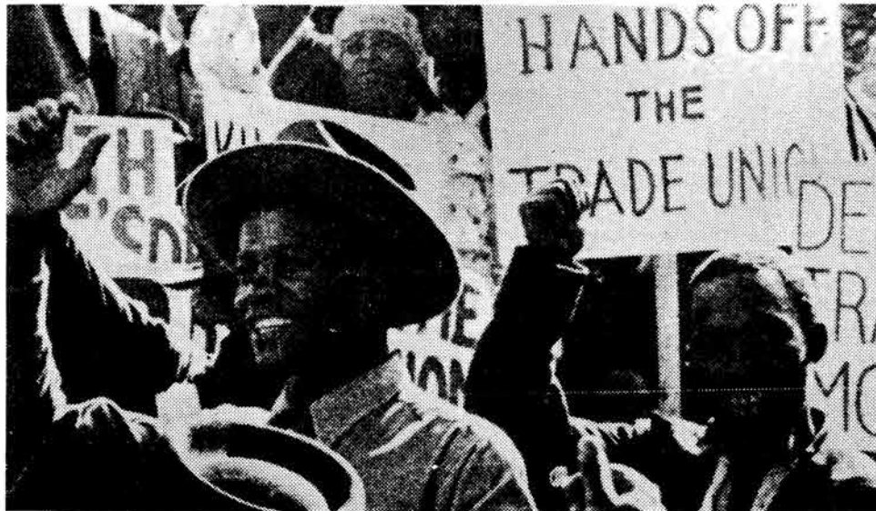
Struggle in South Africa has continued for generations. Above, 1952 meeting to launch "Defiance Campaign" against apartheid called by African National Congress. "Freedom Charter," adopted in 1955, remains manifesto of movement for a Free South Africa.

In the wake of the massacre of scores of Black protesters in Sharpeville, the African National Congress was banned in 1960. Its principal leader at the time, Nelson Mandela, was imprisoned in 1962 and sentenced to life imprisonment in 1964.