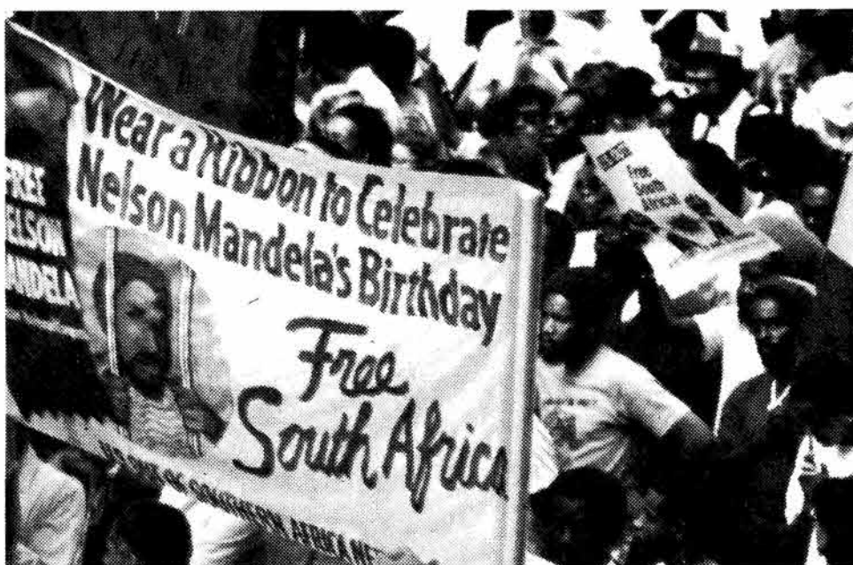
Free South Africa rallies have been demanding an end to U.S. government backing for apartheid.

The propaganda offensive coincides with the spread of anti-apartheid protests in