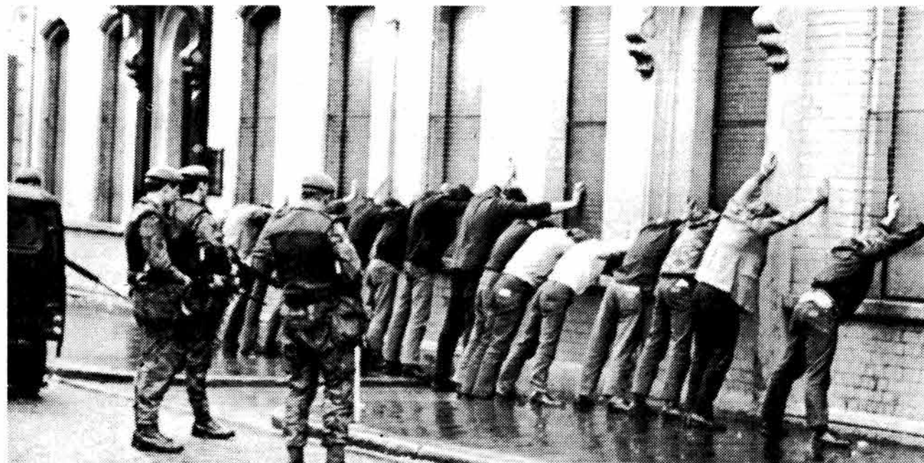
British troops in Northern Ireland

We should join in protests against British repression in Ireland and against Washington's support to British colonial rule. That means opposing the proposed British-U.S. agreement that would make it possible to extradite Irish freedom fighters to Britain.