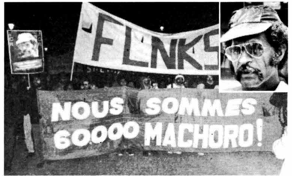
Rouge Solidarity demonstration in Paris last April in response to call from Kanak Socialist National Liberation Front (FLNKS). Eloi Machoro (inset), central leader of FLNKS, assassinated by French occupation forces in January 1985. Sign reads: "All 60,000 of us are Machoros." The total Kanak population is 60,000.

The colonization in Guadeloupe and Martinique is very different than at home. In New Caledonia, the Kanak people are a