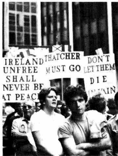
New York 1981 protest in solidarity with Irish struggle demanded end of British rule in Northern Ireland.

Under the November 15 agreement, the Irish government for the first time accepted British colonial rule over part of Ireland. In exchange for this concession, Dublin will be able to express its opinion on the systematic discrimination carried out by the British and their supporters against the nationalist population in the north. Catholics, who comprise the bulk of the nationalists, make up 40 percent of the