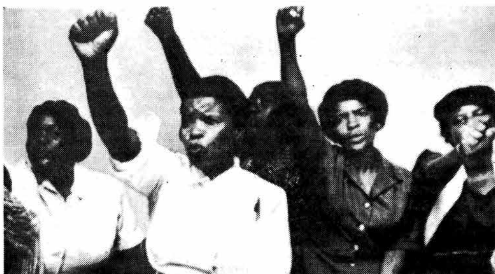
Striking hospital workers in Soweto stand up to government union busting, which included arresting 718 people.

Nonetheless, Botha complained bitterly, "we have become the number one outlaw in the international community."