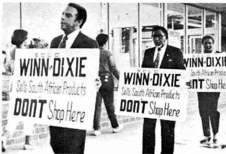
Atlanta Mayor Andrew Young, Southern Christian Leadership Conference (SCLC) President Joseph Lowery, and SCLC/Women protesting the sale of South African products by Winn-Dixie stores. The protests have taken place in Florida, Alabama, North Carolina, Louisiana, and Georgia.