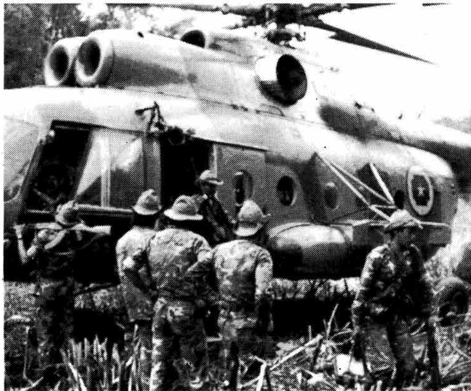
Sandinista armed forces have put U.S.-organized mercenaries on defensive. Nicaraguan Minister of Defense Humberto Ortega called for redoubled efforts against counterrevolutionaries.