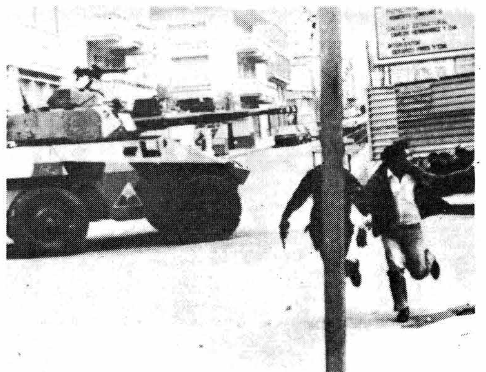
Colombian military used tanks in its assault on Palace of Justice. A total of 92 people were killed during attack.

In the aftermath of the assault, Betancur is continuing to call on the guerrilla organizations to participate in the government's so-called peace process. But the brutal character of the government's siege signals stepped-up repression against political organizations by the Colombian military.