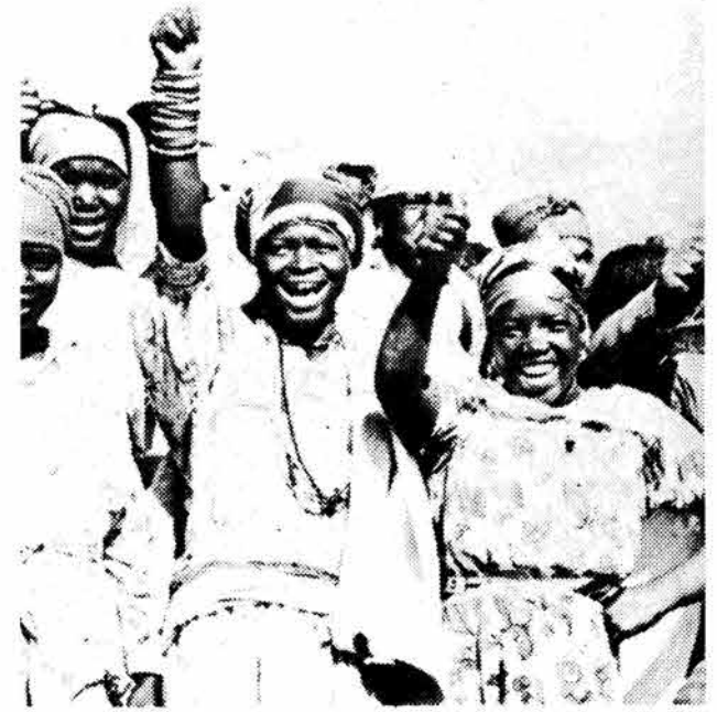
Women Under Apartheid Demonstration in 1957 of peasant women protesting the apartheid regime's extension of pass books to women.

Under the pass laws, an African person must always carry an official record of where he or she has worked and lived and other identifying details. This is a frequent cause for victimizations. At least 12.5 million people