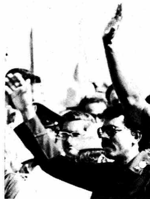
Grenada's late prime minister Maurice B. Cuba, the only country standing up to agricultural and industrial production.

For example, the University of the West Indies has given full accreditation to the Cuban degrees. They have evaluated them and have given them very, very high marks. In fact, they have said that many of the courses offered at Cuban universities