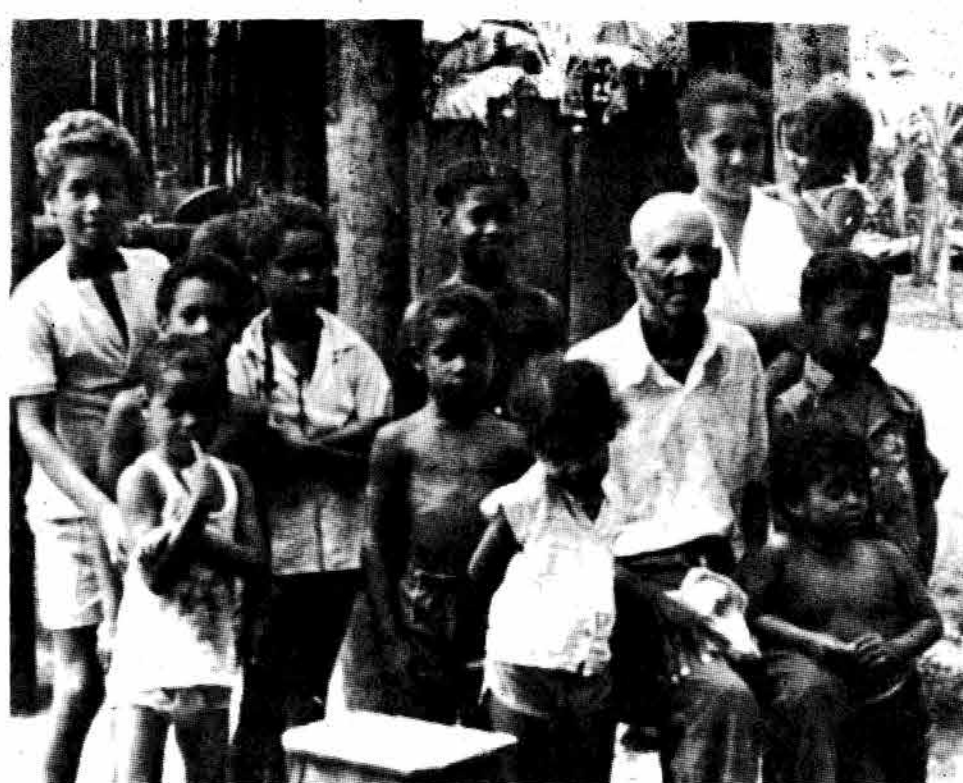
Sunrise Residents of Corn Island. Expansion of badly needed social programs is hampered by impact of U.S.-backed contra war.