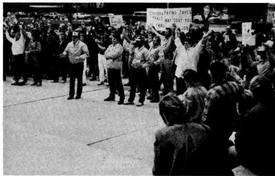
Several hundred meat-packers and their supporters protested outside Ohio Statehouse in Columbus April 11.

A representative in Celeste's office told Local 17A that if it wanted a meeting with the governor, it would have to call off the demonstration. The meat-packers refused.