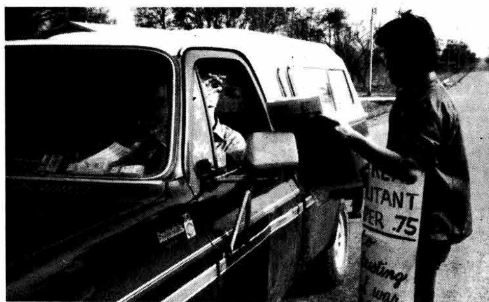
Militant Member of recently concluded southern Illinois team selling Militant . New teams have been launched to Puerto Rico, western coalfields, and Yakima Valley in Washington State.

Conference participants from the Dominican Republic bought the most PM subscriptions. Many people knew of PM and already had subscriptions.