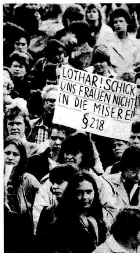
East Berlin action opposing West German abortion laws. Placard reads, "Lothar, don't send us women to misery!" Lothar de Maiziere is East German prime minister.

Abortion rights activists from Ireland, Italy, and France also spoke at the Bonn rally. The National Organization for Women in the United States sent greetings, as did women's groups from a number of other countries.