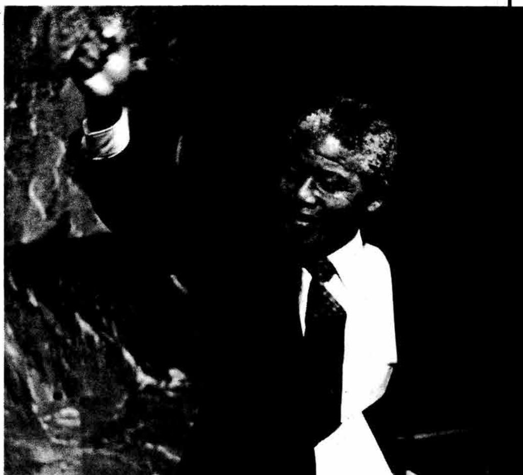
African National Congress leader Nelson Mandela addresses United Nations June 22

To bring an end to this old unjust, inequitable social order, and bring into being a new one characterized by the notions of justice