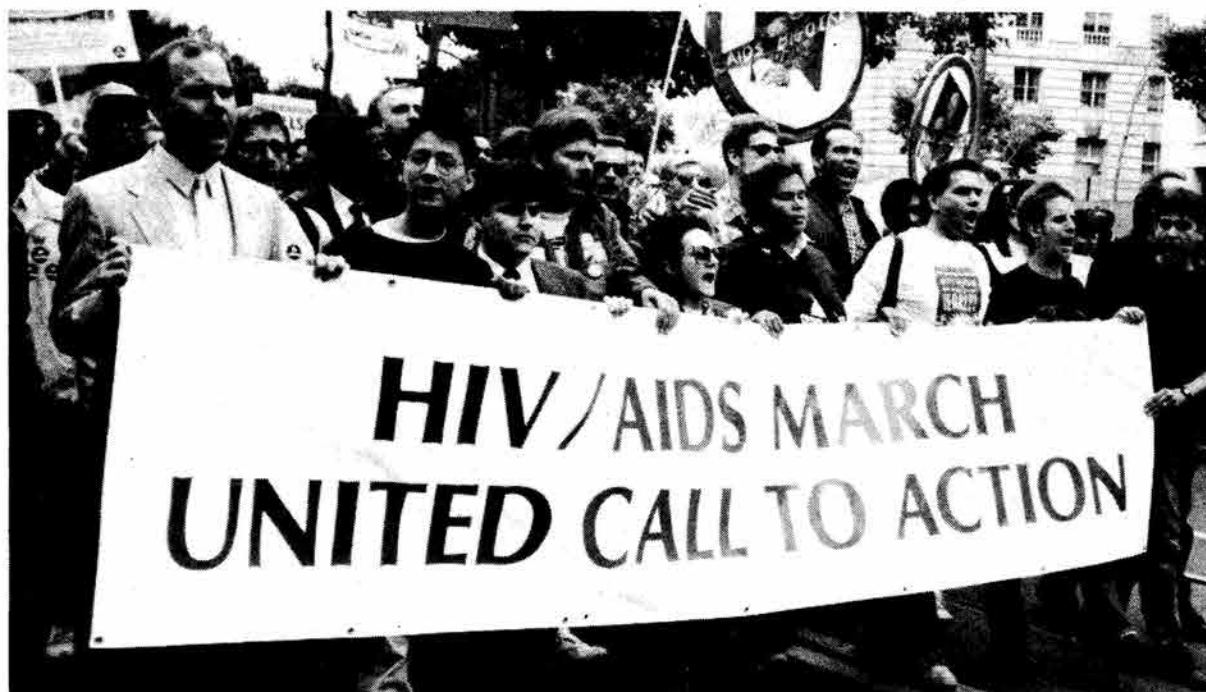
Fifty organizations held June 23 march in San Francisco condemning government inaction on AIDS epidemic