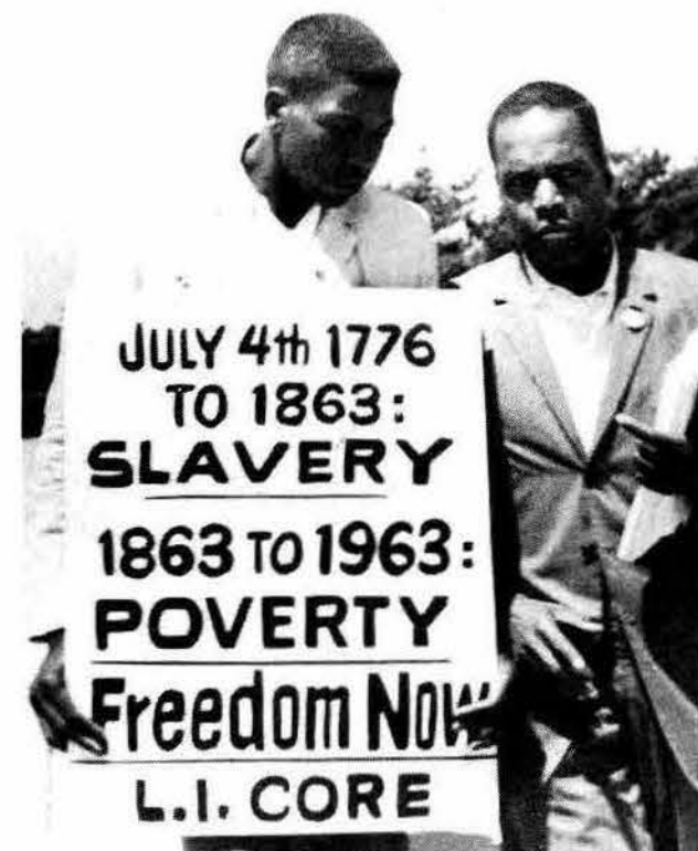
A 1963 protest. Jim Crow system of legal segregation was imposed in the 1890s in former slave states in the South.

Are pygmies in Africa Negroid? Are Bushman in Africa?