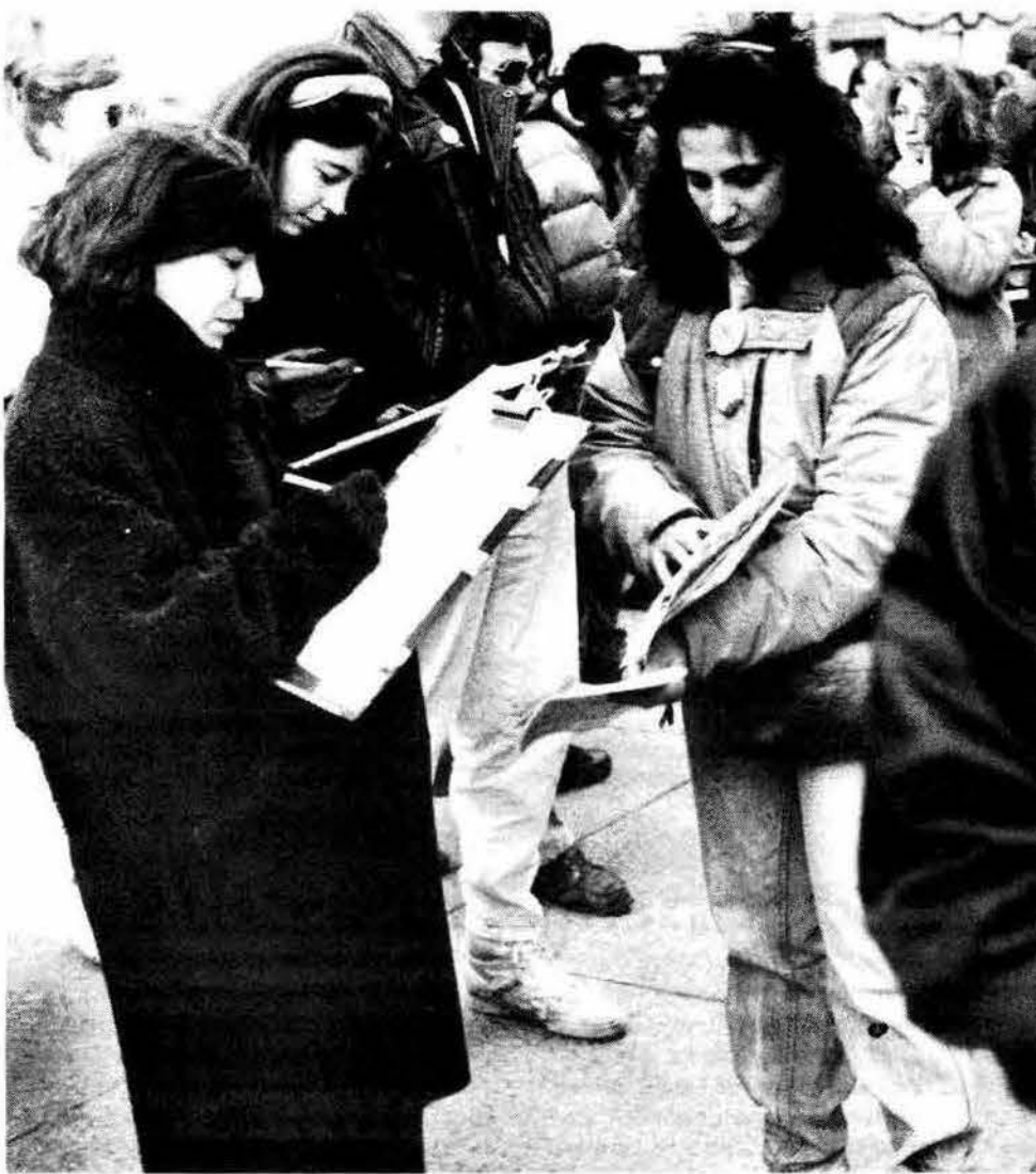
Election petitioning for Socialist Workers candidates. Write-in ballot was universal voting method in United States until late 19th century.

State ex. rel. Lafollette v. Kohler , 228 N.W. 895, 906 (Wis. 1930).