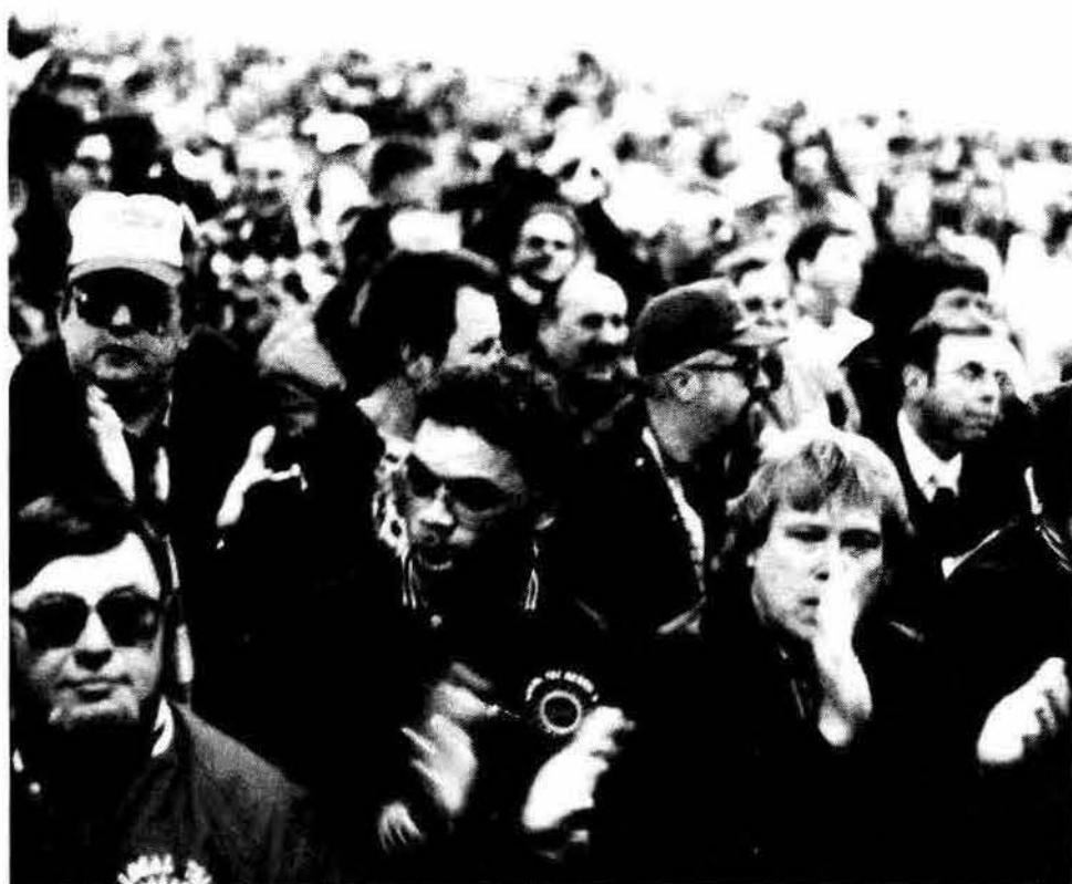
Caterpillar workers in York, Pennsylvania, meet and discuss current stage of fight. Caterpillar is 'part of a movement to destroy unionized labor,' said one worker.