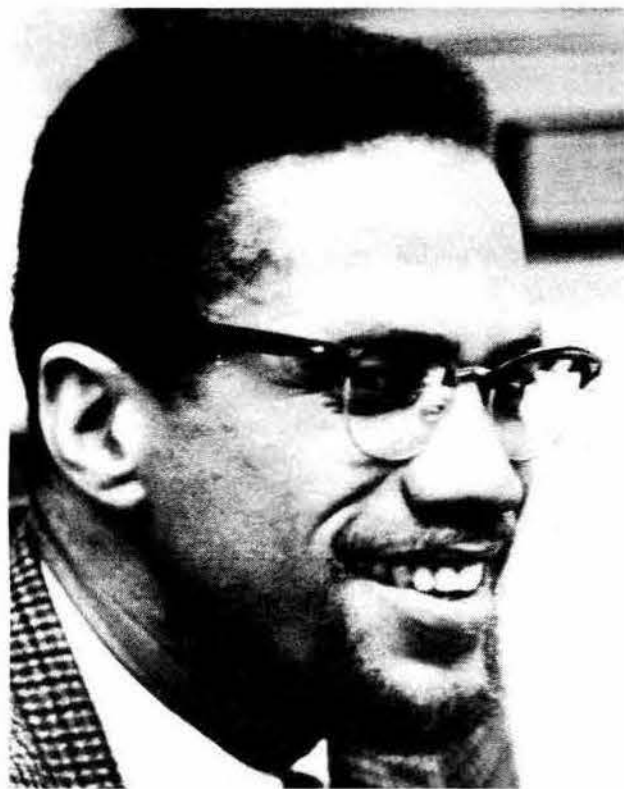
Malcolm X pointed out that the terms Caucasoid , Mongoloid , and Negroid were used by anthropologists seeking to justify the European domination of Africans and Asians.

All the capitalist politicians, the preachers, and the academicians rallied their efforts behind this justification. After Charles Darwin presented the theory of natural selection for the evolution of species in 1859 — a gigantic conquest