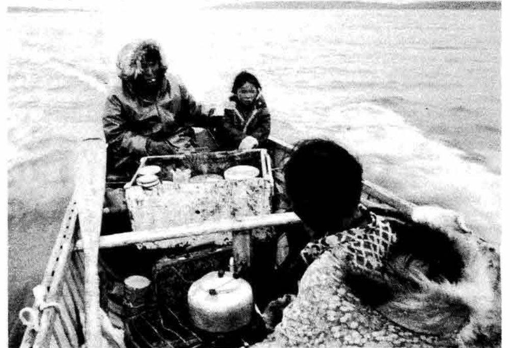
Inuit family at Melville Sound. Quebec government has stepped up racist campaign against Cree and Inuit people. 'The territory they claim is theirs is still ours,' asserted Quebec energy minister. 'Natives are not going to stop us.'

The NYPA decision was strictly a business decision. The authority had demanded that Hydro-Quebec lower the selling price of its