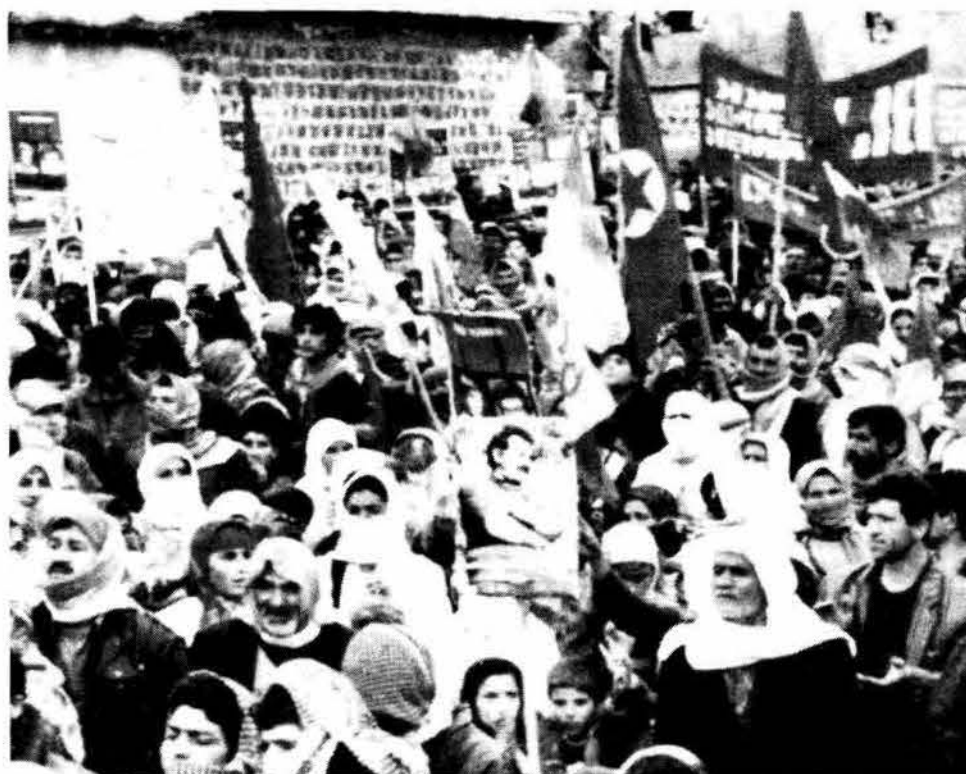
Kurdish demonstration in Cizre, in Turkish Kurdistan.

In the eyes of Turkish officials the entire Kurdish population is the enemy. "We have