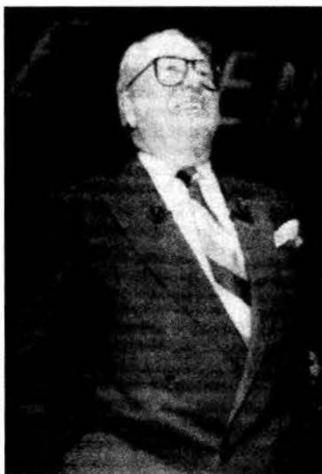
Ultrarightist leader Jean-Marie Le Pen raises slogan 'France for the French.'

The National Front collected almost 14 percent of the vote, up from 10 percent in 1986. The other significant increase was for two parties that focus on questions relating to protection of the environment, the Verts (Greens) and the Ecology Generation. They