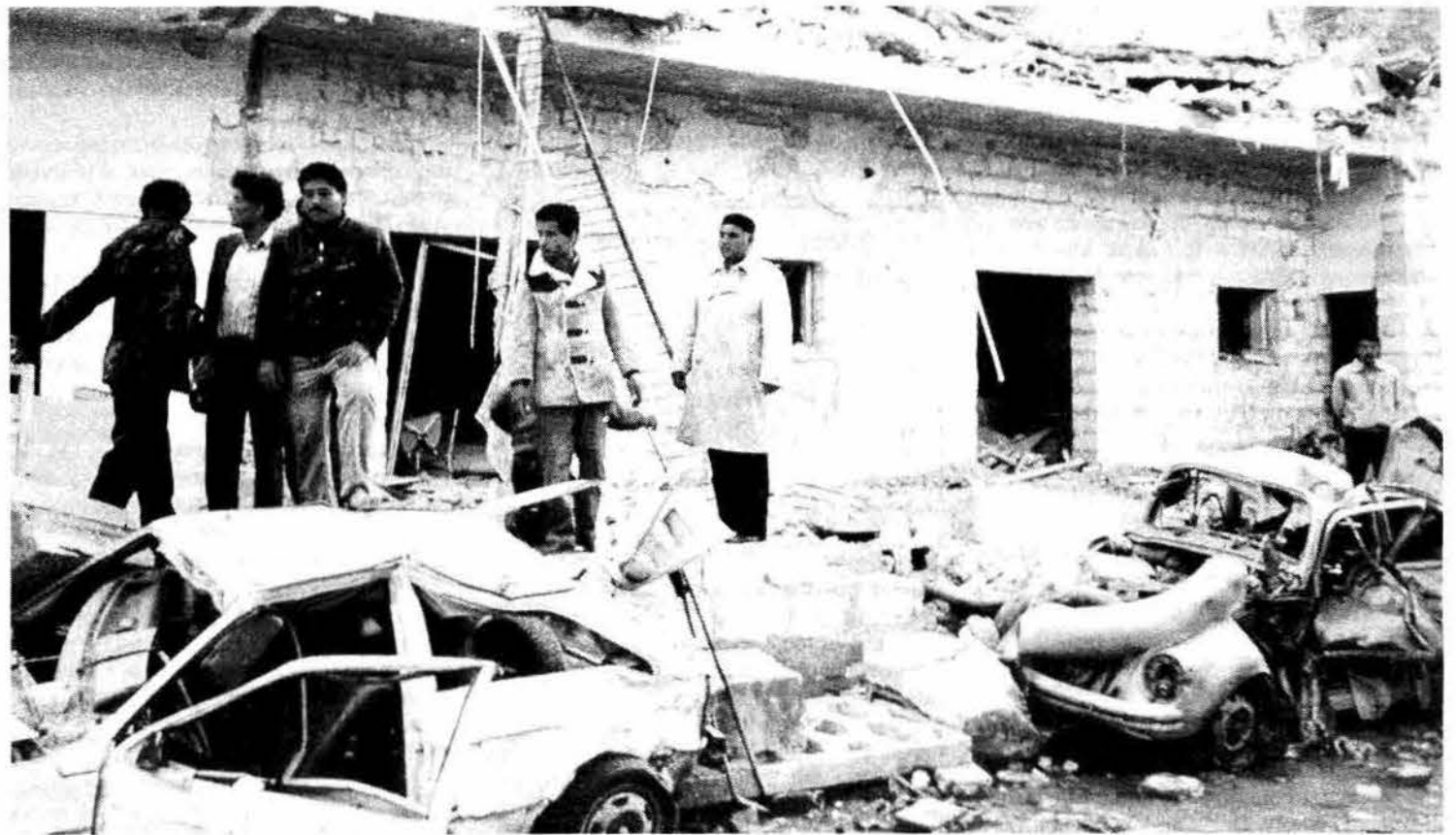
Tripoli after U.S. bombing April 15, 1986, which left 37 Libyans dead. In ominous move, UN Security Council set April 15 deadline for Libya to comply with 'antiterrorism' resolution. Washington has attacked Libya several times over last decade.

The flight attendants have concluded that it will take a real fight to force Nationair to negotiate a contract. They have sought out opportunities to speak to various union locals. They have been present in support of other labor activities with their buttons and boycott fliers.