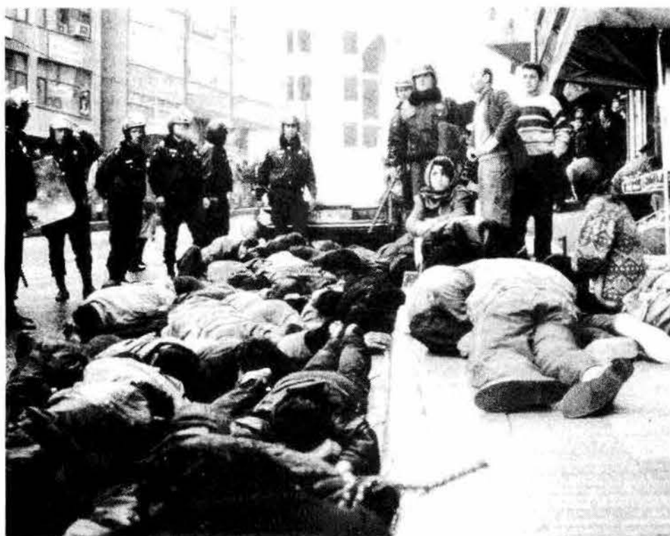
Turkish troops guard rebel supporters who were arrested after clashes

Taking advantage of the Turkish strafing of Kurdish enclaves in northern Iraq, the Saddam Hussein regime began bombing a dozen small towns and villages in northern Iraq forcing some 40,000 Kurds to flee the area. One United Nations official reported "up to 300 heavy artillery shells a day in the area" are being dropped.