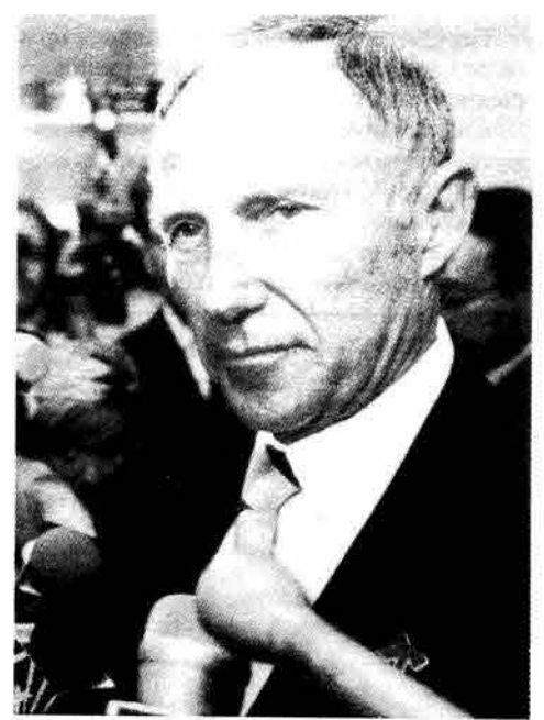
Los Angeles police chief Daryl Gates

The former detective is now a police lieutenant with the special assignment of conducting investigations when cops get involved in a shooting to determine if they acted properly.